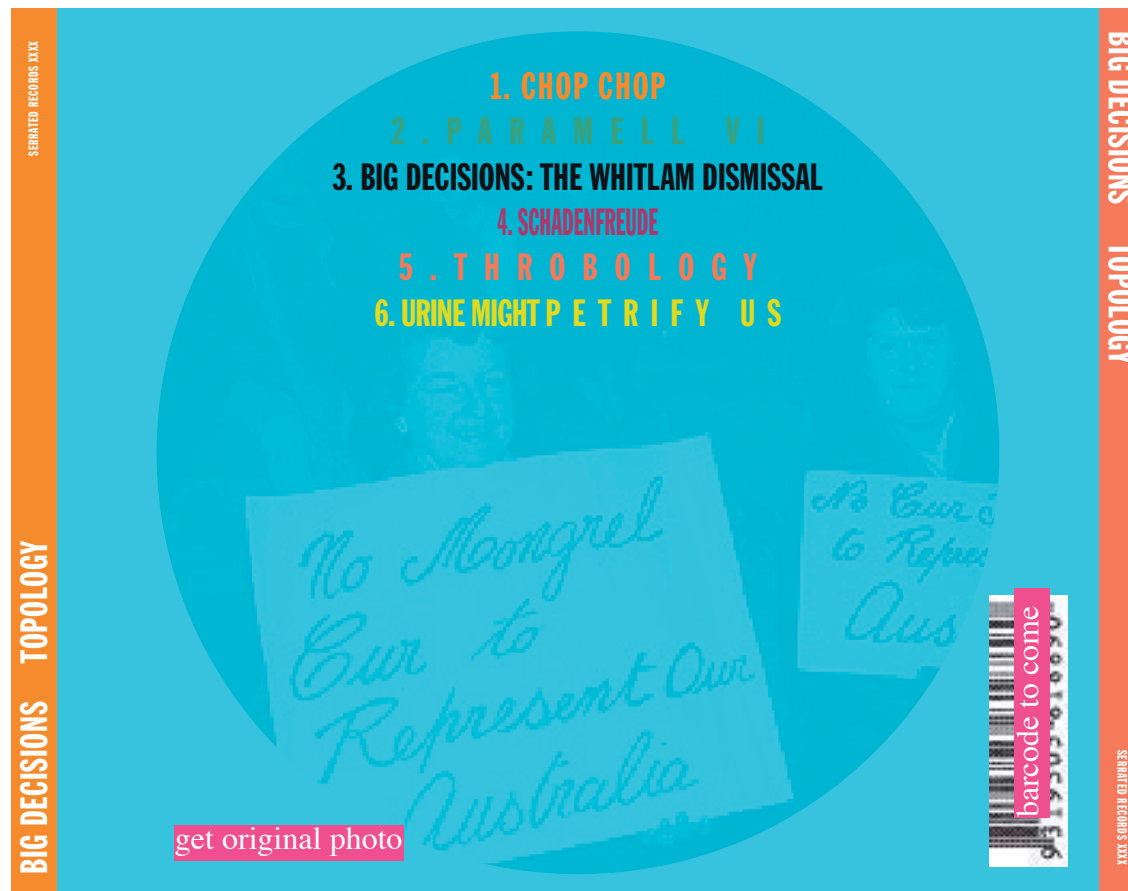
Topology – Big Decisions – Insert Tray (Outside)