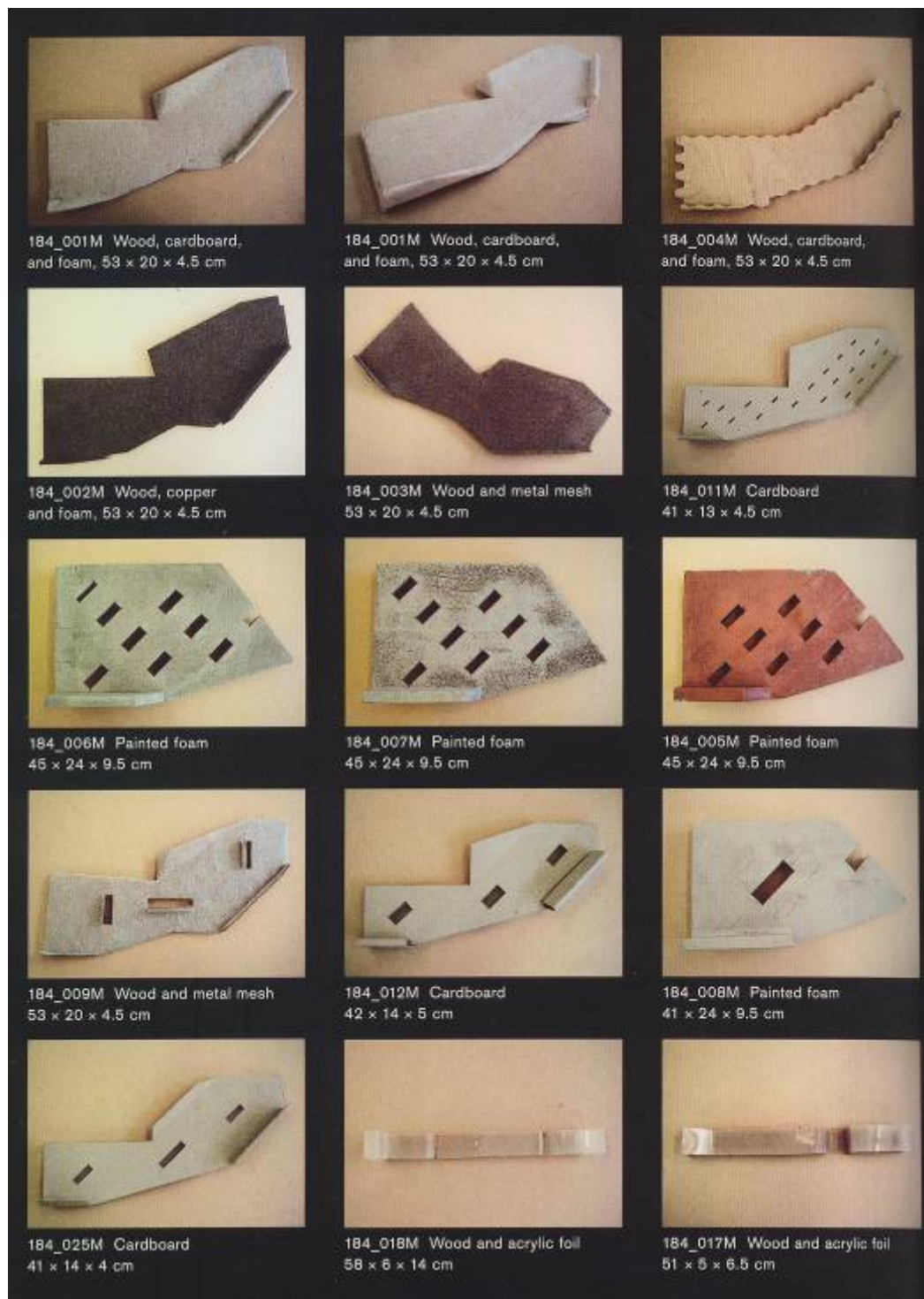
Fig. 2. Herzog and de Meuron, Study for Project No. 184 , Prada le Cure, Production Centre and Warehouse, Terranuova, Arezzo, Italy, 2000 – 2001. Source: Philip Ursprung (ed.), Herzog & De Meuron: Natural History , Montréal and Baden: Canadian Centre for Architecture and Lars Müller Publishers, 2002, p. 266. (© Herzog & de Meuron.)