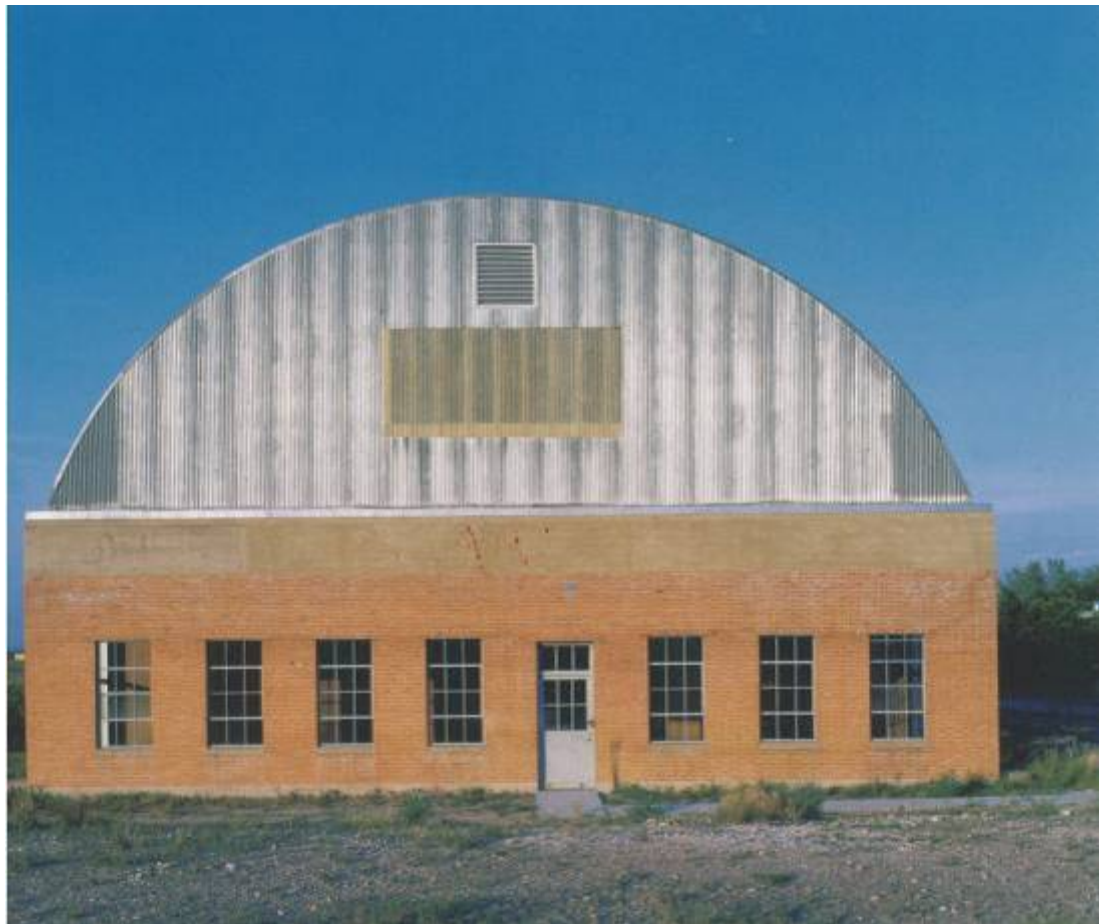
Fig. 5. Donald Judd, Exterior view of artillery shed housing permanent installation of Donald Judd's 100 untitled works in mill aluminium, 1982-1986. Permanent collection, The Chinati Foundation, Marfa, Texas.