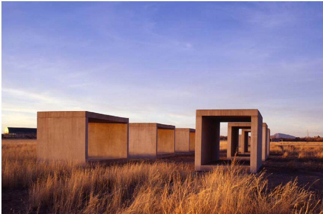
Fig. 4. Donald Judd, 15 untitled works in concrete (detail), 1980-1984. Permanent collection, The Chinati Foundation, Marfa, Texas.

The permanent concrete installations that Judd sited in the Marfa landscape (Fig. 4) illustrate the extent to which the focus of Judd's later work had shifted away from opposing Greenberg and towards an exploration of more architectural qualities of scale, landscape and permanence. There are parallels between these works and his earlier work in the rectangular shapes and the play between openness and enclosure, but the connection with 'Specific Objects' is much less rigid. Judd's exploration of typically architectural qualities makes for interesting relationships between his architecture and art at Marfa. Arguably, the opportunity to create objects on various levels allowed his work to explore the nature of, and possibilities for, art and architecture to a much fuller extent than he had ever previously been able to.