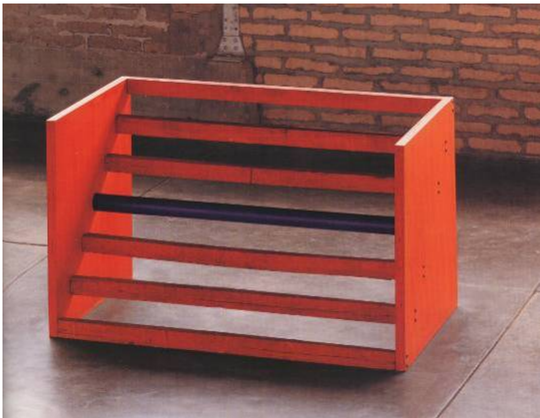
Fig. 3. Donald Judd, Untitled , 1963. Light cadmium red oil on wood and purple lacquer on aluminium, 12.2 x 21 x 122 cm. (© Donald Judd/VAGA. Licensed by VISCOPY 2009.)

is still clearly anti-modernist in the Greenbergian sense, in that he repeatedly uses the generic term 'art' when discussing the visual arts. On the other hand, unlike in 'Specific Objects', he does explicitly discuss 'architecture' and uses this disciplinary term alongside the generic 'art' throughout the paper. It is possible that Judd himself would have also differentiated between art and architecture during the 1960s, but equally that his rejection of Greenberg's modernism bound his early arguments fairly tightly to a notion of generic art over disciplines. As a result and despite its widely acknowledged architectural themes, Judd makes no mention of the disciplinary term 'architecture' in 'Specific Objects' and perhaps therefore avoids undermining the essay's anti-Greenbergian agenda. 16 Furthermore, by the 1990s, Judd had been working at Marfa for over a decade and his considerable involvement with interventions to existing buildings within the town during this time may have played some part in his more explicit consideration for architecture in relation to the arts later in his career.