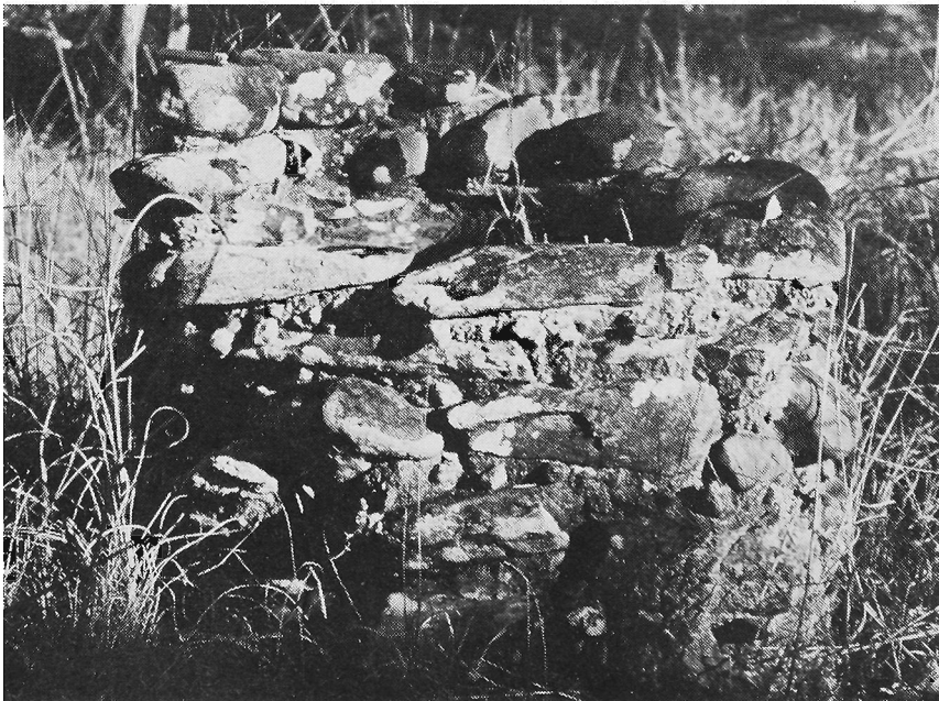
A Chinese Oven, one of the items of heritage which the Palmer River Historic Preservation Society is seeking to save.

Under the guise of revenue raising, the Thorn administration moved quickly to amend existing legislation, placing further penalties on Chinese. Firstly, the duty on rice was increased from £2 to £7/6/8 per ton under the Customs Duties Act , despite criticism that the action was a “miserable contradiction” of the avowedly free-trade principles of the government. 36