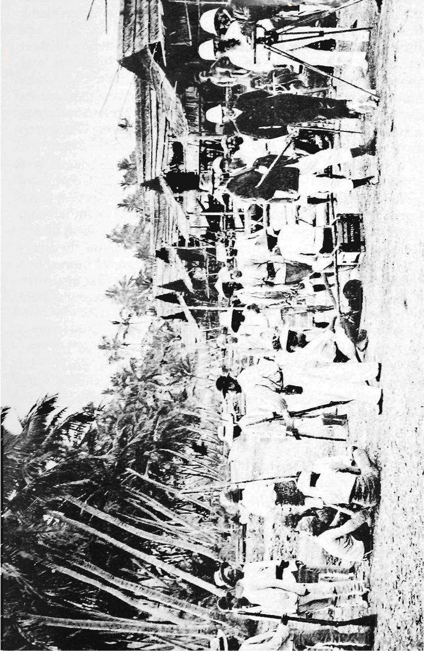
When this expedition was setting out from Port Moresby for the crest of the Owen Stanley Range in 1885, Moresby had a European population of about 70 and was being developed as the administrative centre of British New Guinea.