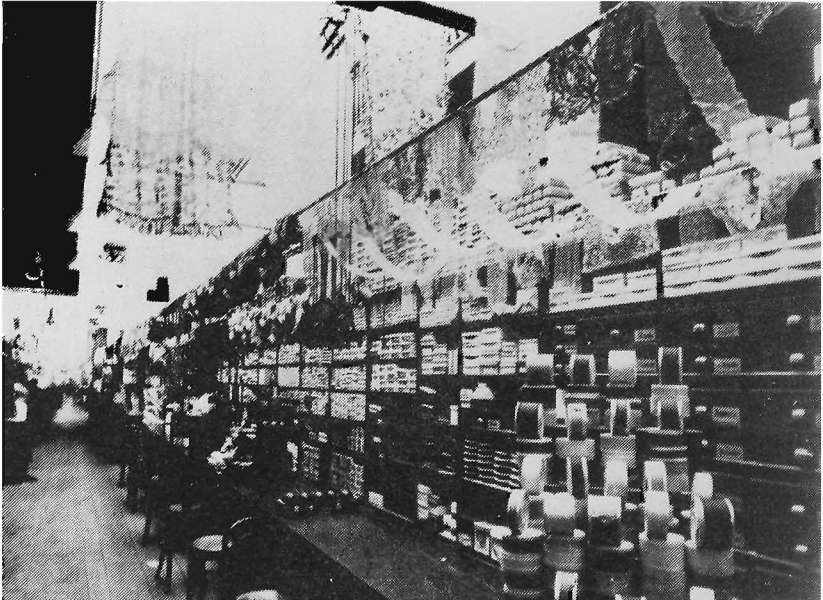
The haberdashery section inside McWhirter & Son, circa 1911.