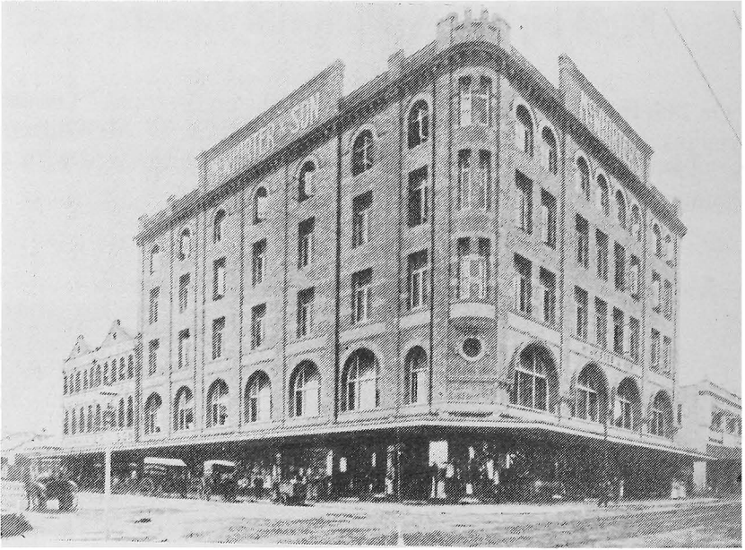
McWhirter's dominating the Wickham and Brunswick Street intersection in the Valley, 1913.