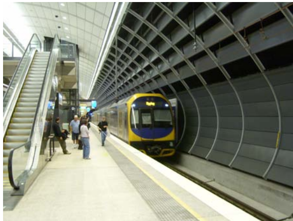
Picture: the new Macquarie University Station, Sydney. C Hale, April 2009.

In summary, CityRail currently faces significant pressures on peak demand levels and crowding problems. Potential options for CityRail include continuing efforts toward establishing a more responsive planning posture. Increased monitoring and tracking of key demand/supply/capacity metrics may assist in directing effective responses to travel demand pressures. Continued evolution toward a more differentiated and efficient fare structure also needs to be considered, and may hold the potential for fare structures that provide opportunities for increasing fare revenues – which would assist in addressing financial constraints. Options to shift passenger's choice of CBD station may or not be workable. And finally, increased efforts in researching and identifying demand management approaches and techniques seems to provide a way forward, along with continued engagement in understanding the customer experience of peak period travel.