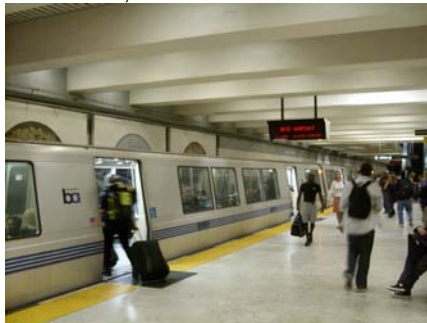
Picture: Civic Centre BART Station, downtown San Francisco. C Hale, November 2008

It may be that BART's current demand management research phase needs time for completion before the planning and analysis is in place for more engaged discussion on the use of pricing options such as peak-differentiated fares.