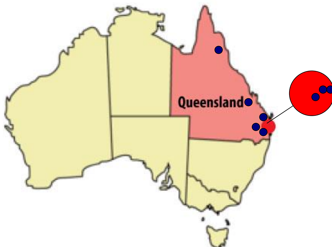
Figure 1. Locations of the 8 Centres (3 in Brisbane itself).

Eight O&EECs in Queensland, Australia agreed to participate in the research. These included Centres from Brisbane (3), South-East Queensland (3) and northern coastal (2) locations (see Figure 1). The aim of these centres is to “promote, develop, provide and deliver highly effective outdoor and environmental education programs for schools and the community, and provide professional development for teachers” (Queensland Department of Education, Training and the Arts 2003).