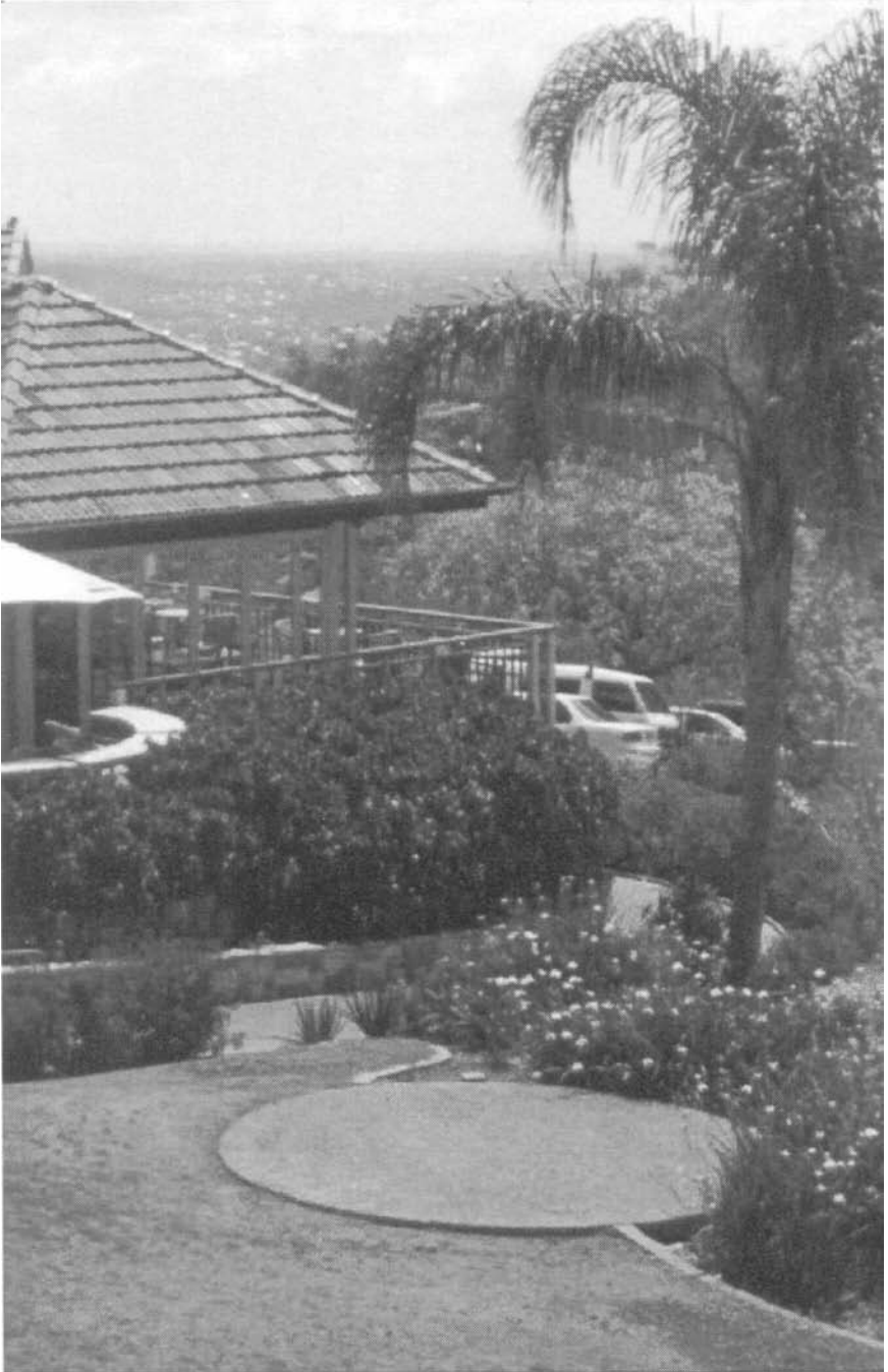
Plate 3. Mt Coot-tha kiosk with the view to the north of Brisbane.