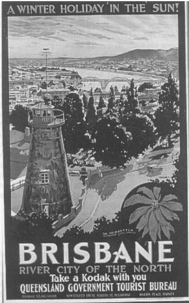
Plate 2. Percy Trompf (1902-64) Brisbane: River City of the North , c1936. Purchased 1986. This poster was commissioned by the Queensland Government Tourist Bureau to promote a visit to Brisbane during the winter months. The poinsettia, recently chosen as Brisbane's floral symbol, is then in full bloom.

By 1959, when Queensland celebrated 100 years of its separation as a colony from NSW, Walkabout magazine reflected on a city with a population over half a million, and the largest river port in Australia. With a power station and a sugar refinery on its banks at New Farm, wharves, freight and factories remained the main use of the river from Bulimba and Teneriffe to the city centre and West End. Nonetheless, Walkabout created a picture of a city where vegetation was often paramount.