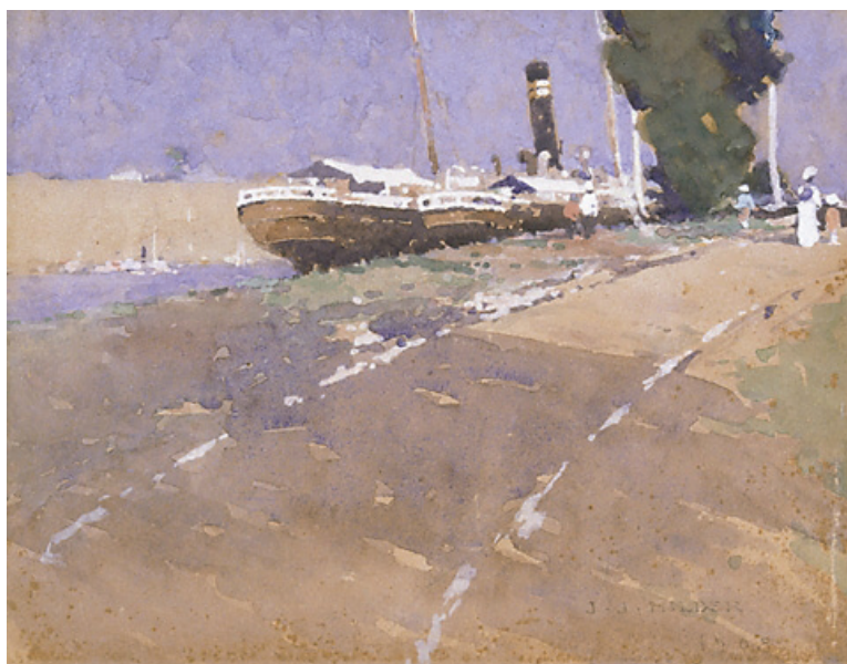
Figure 10: J.J. Hilder, Brisbane River , 1908. Water-colour, opaque white on buff wove paper, 18.1 x 22.9 cm