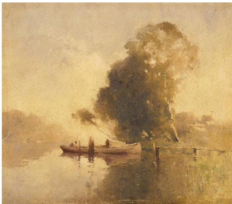
Figure 7: J.J. Hilder, Dora Creek , 1916. Pencil, water-colour, 22.3 x 25.8 cm sheet