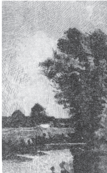
Figure 2: J. J. Hilder, pen and ink copy of A.D. Peppercorn, The Pool