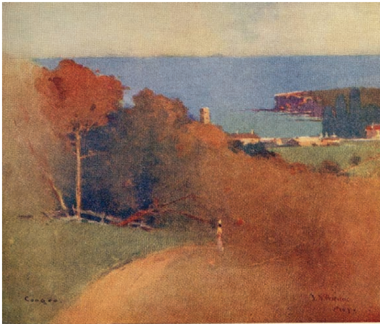
Figure 6: J.J. Hilder, Coogee , 1907. Pencil, water-colour on ivory laid paper, 21.8 x 25.4 cm