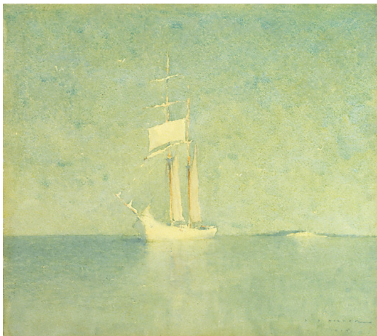
Figure 9: J.J. Hilder, Becalmed , 1915. Water-colour, 37.0 x 42.0 cm