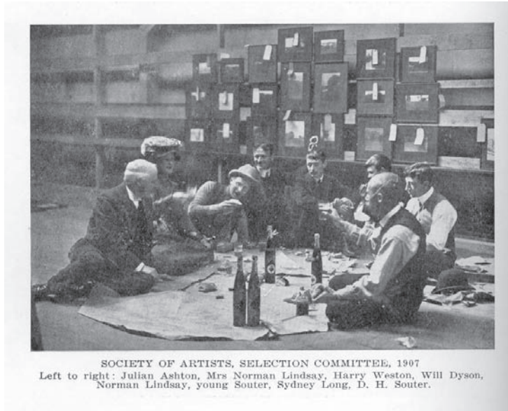
Figure 5: Society of Artists, Selection Committee, 1907