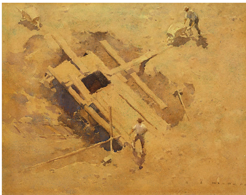
Figure 8: J.J. Hilder, Filling the Truck , 1914. Water-colour on ivory wove paper, 20.1 x 25.6 cm Source: Bequest of Dr Sinclair Gillies 1952. Collection, Art Gallery of New South Wales.