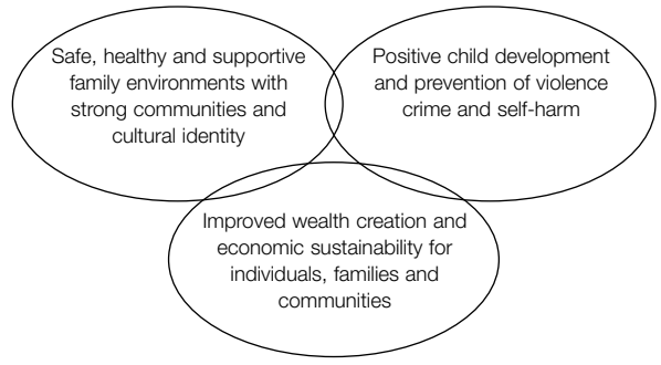
Figure 2: "Overcoming Indigenous Disadvantage" Framework

seven key areas for strategic action (see Figure 2). These areas range across child development, education, health, community functioning, and employment issues. These seven strategic areas are described as the key levers for delivering benefits for Indigenous Australians, and are therefore important in shaping policy thinking for all governments in the context of COAG. While a multi-layered approach seems highly desirable, and all these strategic areas are arguably very important, the wide-ranging nature of the schema raises some questions about generalisation across different circumstances, the interaction patterns between the variables, and the basis for targeted policy priorities in specific locations.