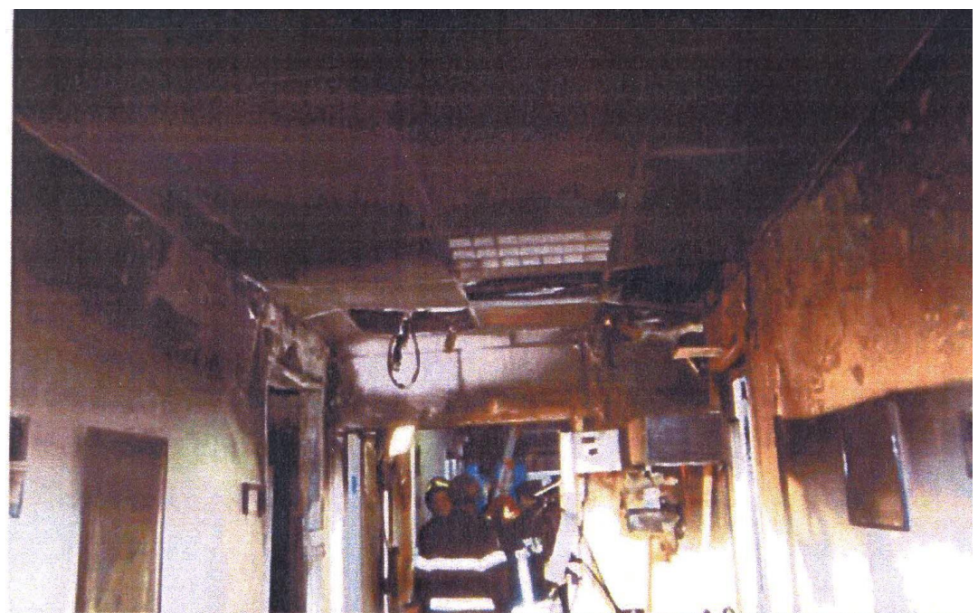
Figure 1: Corridor of the ICU after the fire event