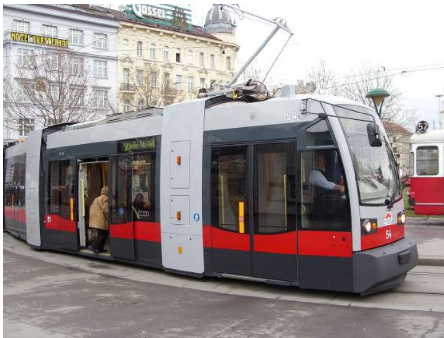
Figure 11 – Light rail, Vienna: Brisbane is yet to embrace a multi-tiered, fully-integrated vision for public transport.