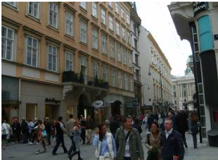
Figure 9 – Pedestrian area, central Vienna. C Hale, Sep 2007: Viennese planning emphasises the separation of activity areas from through-routes for cars.

"When undertaking the lines extensions and network expansions priority is given to those sections where there is adequate potential for further urban development or an essential contribution to improve traffic mode split can be made..." (Vienna, 2003:, 27)