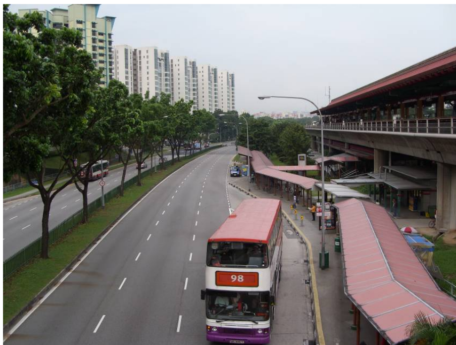
Figure 7 – Lakeside transport interchange, Singapore

The LTA document sets high targets for providing speedy door-to-door travel times to the average public transport user – this implies a close degree of integration between the modes, and short connection times delivered via high levels of service frequency. In addition, the fare structures and travel pass options for public transport ticketing are set to be revised in order to ameliorate transfer costs and encourage multi-modal travel (LTA, 2008).