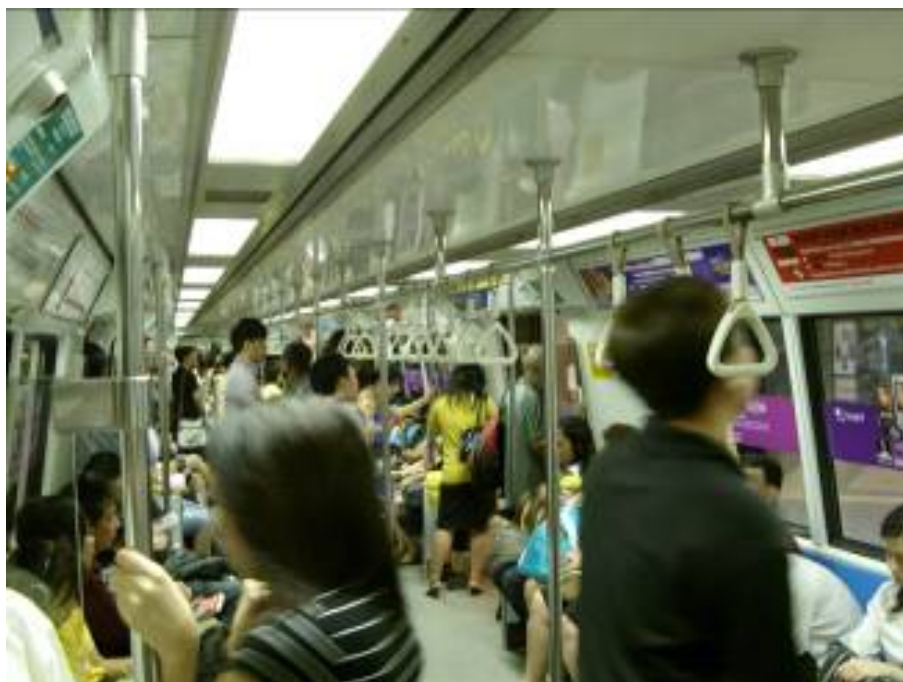
Figure 1 – Singapore MRT.

The first of these ends is to be pursued through the facilitation of better public transport performance – which will be measured against targets and benchmarks that are outlined in the Masterplan. The target of 70% of peak hour journeys by public transport is a case in point. There are also targets in relation to average travel times on a door-to-door basis. Ticketing measures are proposed to facilitate better transfers and encourage trips. The expansion of the Mass Transit Rail network (SMRT) is one of the most significant initiatives outlined. Another important target is the goal of doubling daily public transport trips to 10 million by 2020 (LTA, 2008).