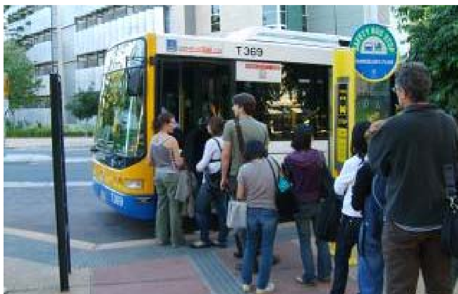
Figure 4 – Bus stop at the University of Queensland: Transit infrastructure and service at Brisbane's significant travel activity generation locations may be under-capitalised.

An important reference point is the ABS (2008) analysis of public transport use in Australian capitals. The research suggests that basic network failings and lack of service provision are key elements in low mode share figures – rather than some innate cultural enmity toward public transport. The ABS suggests that "no service at convenient time", "takes too long" and "no service at all" are among the top reasons that travellers do not use public transport for commuting in Australian cities.