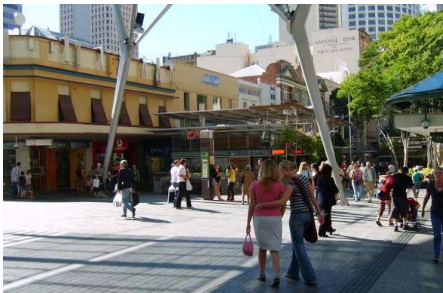
Figure 10 – Queen Street, Brisbane: Queen Street provides a successful example, but pedestrian zones beyond the CBD are hard to find.