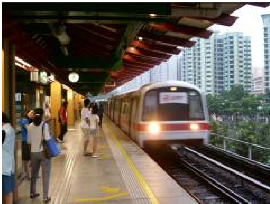
Figure 12 – MTR Station, Singapore: Brisbane increasingly needs to investigate best-practice examples in public transport infrastructure.