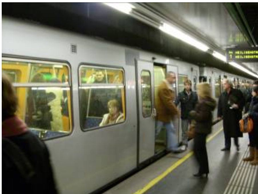
Figure 2 – Vienna U-Bahn

The Viennese document addresses the issue of “awareness raising” – a process in which transport planners, policy-makers and politicians are recommended to actively engage in the ongoing promotion to the public of sustainable transport in preference to car-based transport. The Masterplan outlines a scenario in which maximum public acceptance of the need for and benefits of sustainable transport could lead to dramatic mode share outcomes. It is said that optimum travel behaviour patterns could eventuate in a situation where 86% of all trips in Vienna were taken by sustainable modes. The “awareness raising” effort aims to go as far as possible toward achieving this type of figure, through advertising, education and information-provision measures as well as encouraging policy makers and politicians to continue emphasising the importance of sustainable travel. This recommendation to political responsibility for sustainable transport is perhaps uniquely-European, and a contrast for New World transport planning documents which generally do not address this issue.