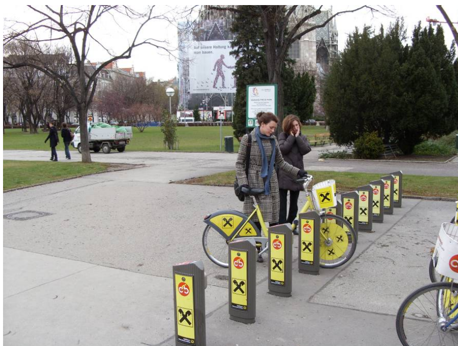
Figure 3 – Bicycle rental, Vienna

In transport terms, Vienna has placed itself in the top echelon of medium-sized world cities with a public transport-based system that seems at times to generate an inferiority complex from planners in Australian or US locations of a similar size. In future, Vienna’s role on the world planning stage will hopefully be as a point of inspiration and a source of leading-edge planning and design ideas. The multi-tiered public transport network offers regional rail, suburban trains, a subway system, light rail and a relatively advanced bus network. These services seem to connect well with land use and significant activity locations. Access by walking and cycling is facilitated through well-designed infrastructure and conditions. When cycling is taken seriously, it can achieve significant mode shares. Vienna is aiming for an 8% share.