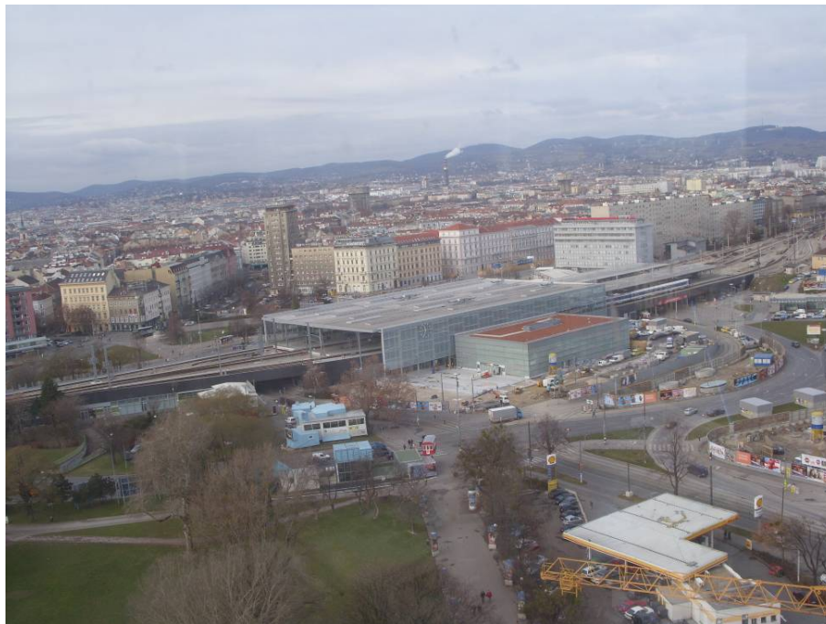
Figure 8 – Praterstern Station, Vienna: The Praterstern hub is an internationally-significant case study in the integration of multiple tiers of public transport – it offers regional, suburban and U-Bahn rail services, as well as light rail and bus.

Particular attention is given to new initiatives to integrate U-Bahn (subway or metro-style services) with “another mode” (presumably either bus or tram, but this concept is not elaborated in depth). This idea is noteworthy because of the tendency to think of metro-systems as stand-alone infrastructure, along with the design challenges of integrating above and below ground transit modes seamlessly.