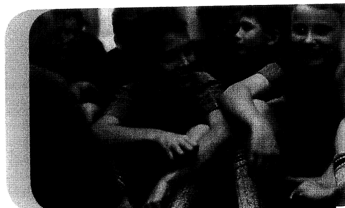
Students from Anglican Church Grammar School, Brisbane.