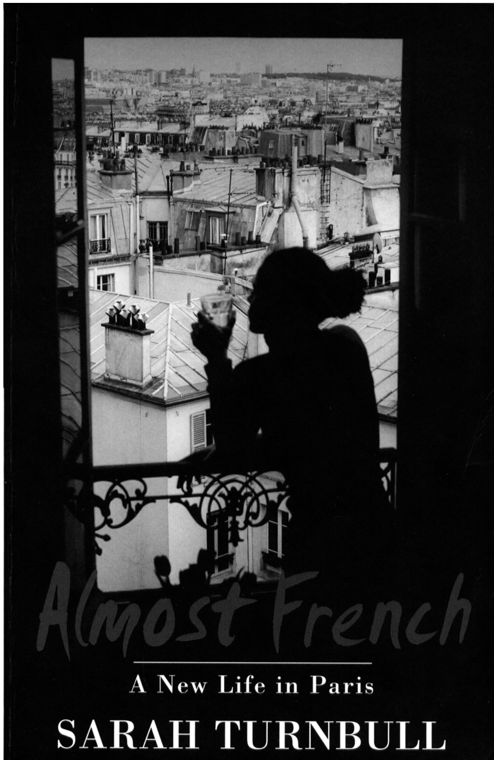
Figure one: the Australian cover.

'Tunnell[ing]' (231) through a 'blind wall' (227), 'hoping for a glimmer of light' (232), the quest for her window onto Paris reflects Sarah's determination to achieve an insider's perspective on French culture. The blind wall is 'a source of frustration, a