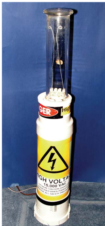
Figure 1. The author's prototype corona discharge ozone generator. The electrodes can be seen in the upper part of the unit covered by the glass chamber.

Ozone is a natural biocide that kills bacteria, viruses and fungi within seconds. It is also moderately soluble in water. At room temperature, its solubility in water by weight at 20°C is 3 grams/litre. An ozone level of 0.04 ppm for 4 minutes has been shown to kill any bacteria, virus, mold and fungus, as well as spores of molds and amoebae. However, in the dose required for disinfection of water, ozone does not produce noticeable or harmful fumes. In 1982, the United States Food and Drug Administration (FDA) affirmed the GRAS (Generally Recognized As Safe) status for ozone for water treatment.