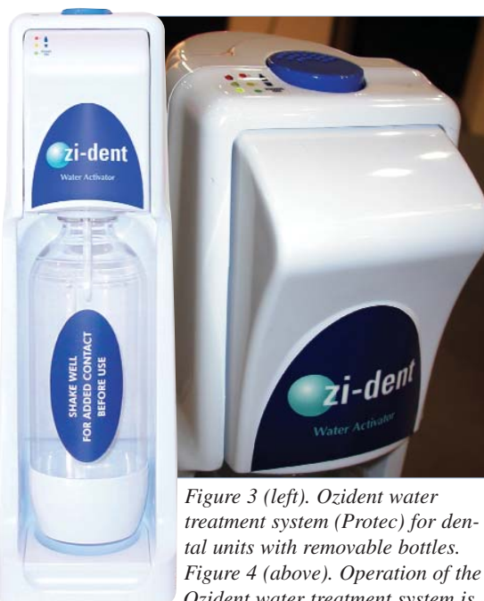
Figure 3 (left). Ozident water treatment system (Protec) for dental units with removable bottles. Figure 4 (above). Operation of the Ozident water treatment system is a simple pushbutton procedure.

Their work has shown convincingly that exposure of DUWL samples to ozone caused the oxidation of ethanol and an increase in the concentration of formate due to oxidation of carbohydrates. They also found evidence of oxidation of the aromatic compounds. 1,2 These types of changes were very similar to those seen when bacterially infected carious dentine was treated with ozone. 3