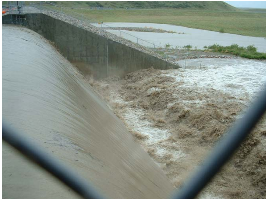
Figure 3 - Photograph of a hydraulic jump energy dissipator in operation - Pine Coulee dam spillway during floods in South Alberta, Canada in June 2005 - Flood flow from left to right

Although some ranking of the search results may be based upon the number of citations or cross-references (e.g. Web of Science™, Google Scholar™), the final selection of the relevant references derive often from an iterative process involving the search, retrieval and analysis of the documents by the engineers, which may lead to further relevant documents.