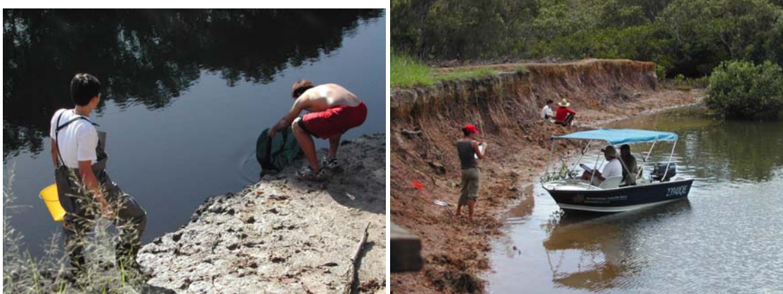
Fig. 2 - Field works at Eprapah Creek on 4 April 2003 Left : Fish sampling. Right : Site 2, looking downstream

FIELD OBSERVATIONS (1) HYDRAULIC AND ENVIRONMENTAL ENGINEERING Water level observations showed consistently maxima and minima slightly after the reference high and low tides (Brisbane bar). This is typical of an estuarine system where the information on tide reversal must travel. Surface velocity observations indicated that the flow reversal was clearly observed with greater delay than that observed with water depth data. This might be the result of possible recirculation zones next to the banks at high tide. The tidal influence was felt up to Site 3 (AMTD 3.1 km) but not at Site 4. The latter site was basically a freshwater system.