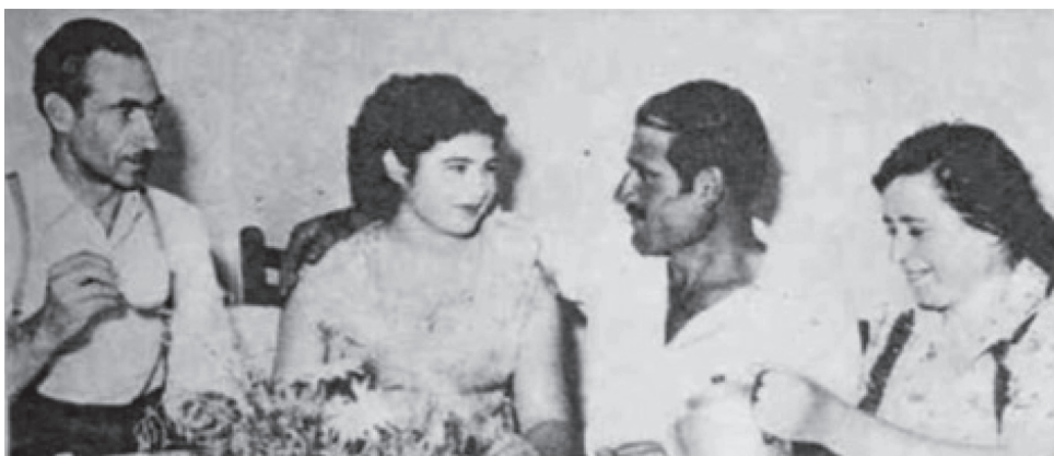
( The Australian Women’s Weekly , 25/1/1956)

During the 1950s and the early 1960s Greek “brides” were arriving in Australia in large numbers and many a time their arrival was attracting the interest of the Australian Press. One such example of “brides’ arrival” can be found in The Australian Women’s Weekly magazine (25/1/1956) and the Argus (7/1/1956). 14