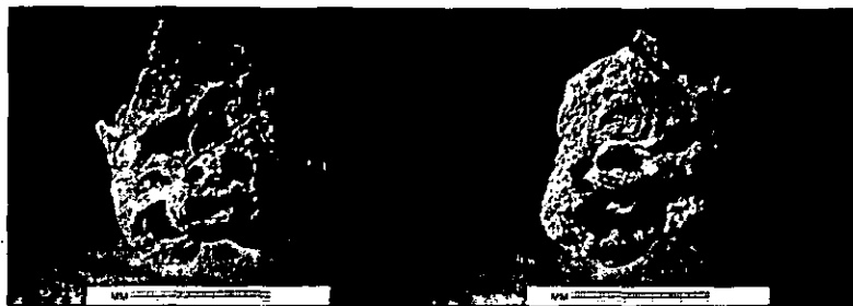
Figure 2 Photograph showing the inner and outer surfaces of a mud wasp nest (Sample No. 1).

excavation trowel, wrapped in a double layer of bubble and thick black plastic, and labelled prior to transportation back to Canberra for analysis. Although the initial study by Roberts et al. (1997) aimed to use dated nests to provide minimum/maximum ages for rock art, this was not a consideration in the current study and subsequently none of the nests were collected from situations under- or overlying rock art.