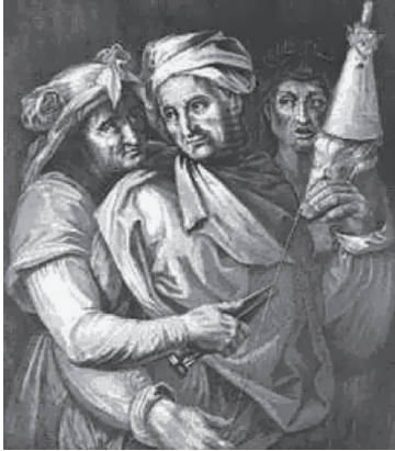
The Three Weird Sisters

An English tradition talks of the Three Weird Sisters , sometimes Wyrd Sisters where Wyrd is the English form of Urtr , one of the Norns, whose name, itself, means fate.