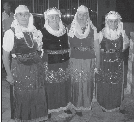
The polyphonic ensemble

This case study, that instigated research in the areas of mythology and philosophy, was an occasion of contextualised reproduction of orality , a polyphonic song performance within the frame of a traditional music festival. The singers, a female amateur ensemble, aged 65–86, were members of the Greek minority of southern Albania, near the Greek-Albanian border. The border area as a location for polyphonic singing constitutes a condition that enhances the complexity of the case study (Tsobanopoulou and Apostolopoulou, under publication). This is because both Albanians and Greeks have claimed the origin of this particular type of singing. Efforts to patrimonialise the traditional practice of polyphony, as national heritage, have taken place on both sides of the border (Herzfeld, 1986). Studies in folk polyphony are currently concerned with the manner in which polyphonic genres sometimes