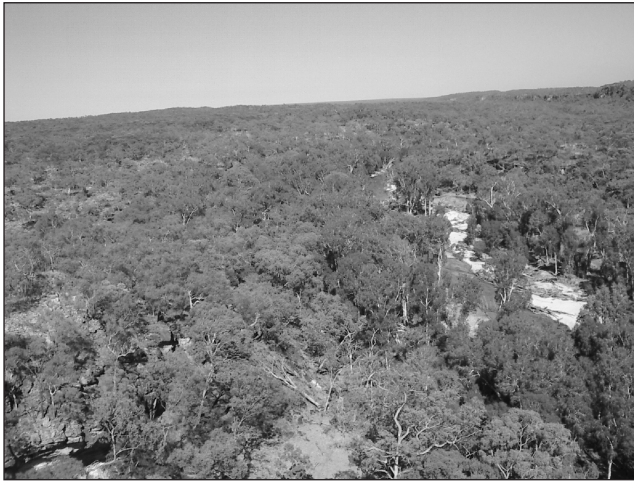
Figure 2 Aerial photograph showing the rugged nature of the country along the Norman River and adjacent sandstone escarpments.

diverse range of site types and suggesting a high density of site occurrence.