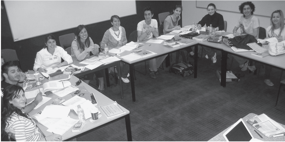
Modern Greek third year students at the Adelaide University Campus, 2007