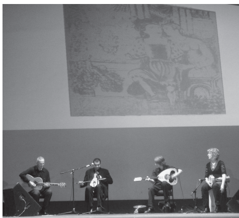
Top: Conference cultural event “A Tribute to Crete – Kazantzakis” presented by Greek Lyceum of S.A. Inc.