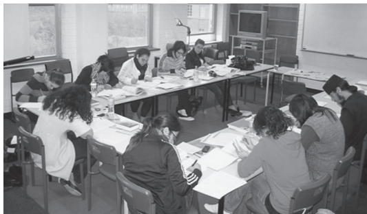
Modern Greek Upper level students at the Adelaide University Campus, 2008