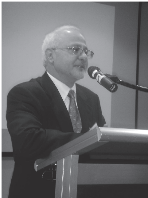
HE Achilleas Antoniades, Cyprus High Commissioner addressing the conference