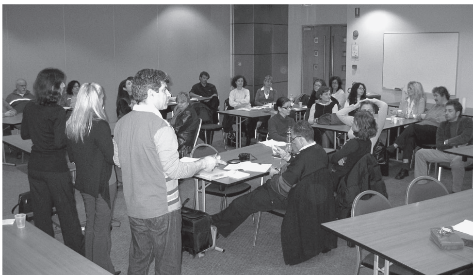
Professional Development for teachers of Modern Greek during the 7th International Conference on Greek Research and organized by the Modern Greek section at Flinders University