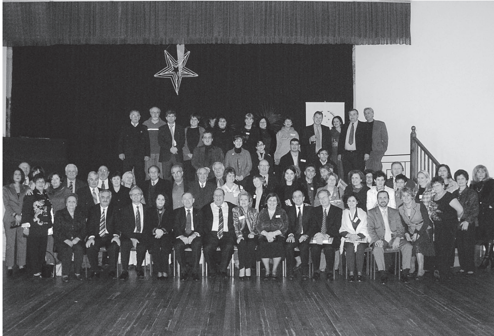
Reception hosted by the Greek Orthodox Community of South Australia