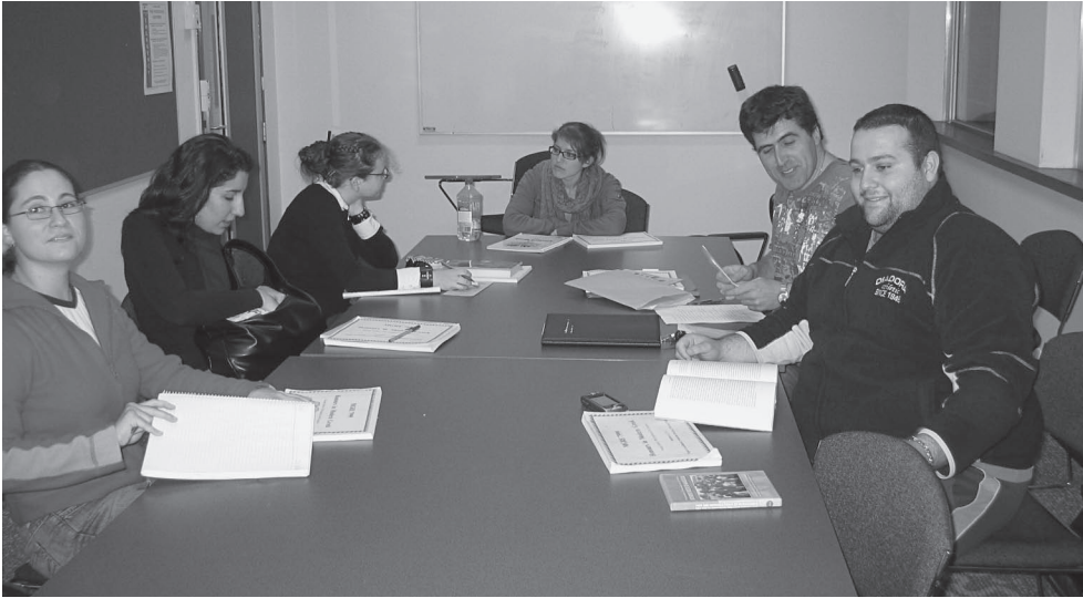
The 2008 group of Honours Modern Greek students