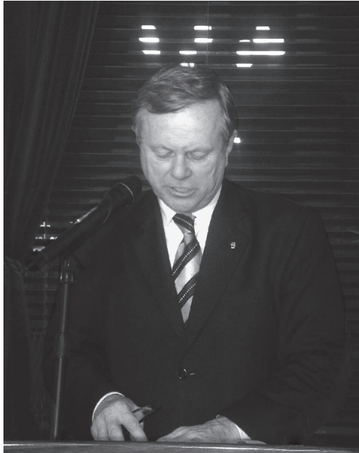
Hon Mike Rann MP, Premier of South Australia and Patron of the conference at the official opening of the 2007 Conference at Parliament House