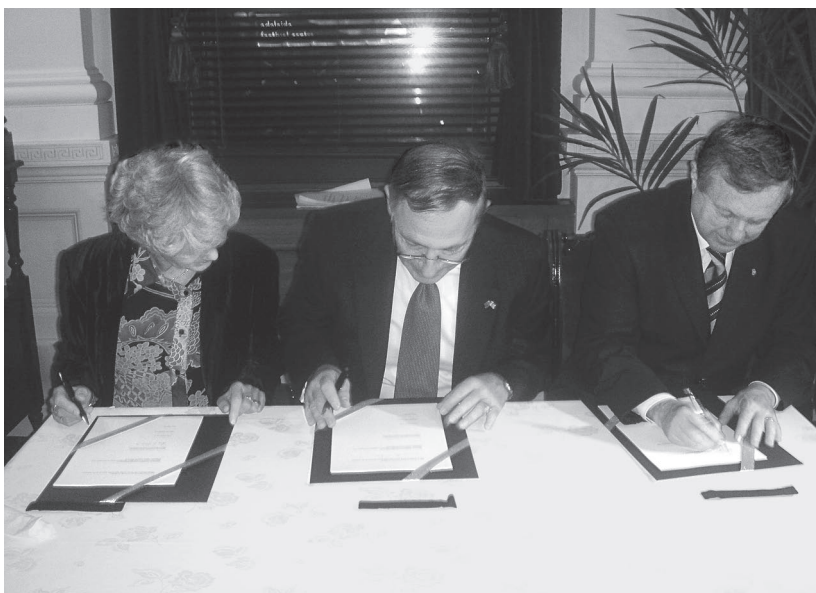
Memorandum of Understanding between Flinders University, Greek and South Australian Governments to establish a Centre for Hellenic Language and Culture in South Australia