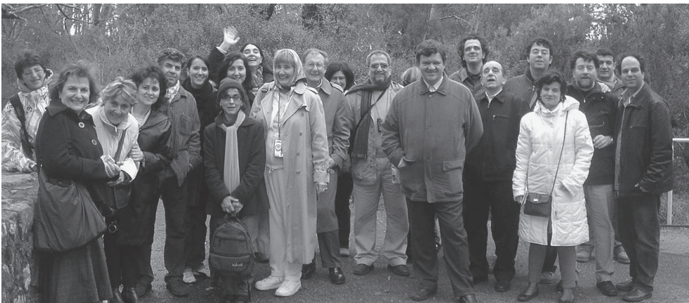
Conference delegates visiting Cleland Wildlife Park