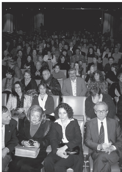
Right: Conference officials and audience at the Conference cultural event “A Tribute to Crete – Kazantzakis” presented by Greek Lyceum of S.A. Inc.