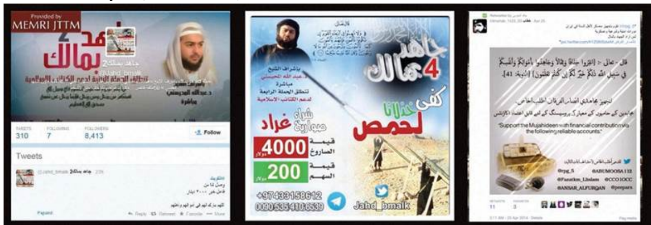
Fundraising Images from ISIS Twitter Accounts

1 The account tweeted that “if 50 dinars is donated, equivalent to 50 sniper rounds, one will receive a 2 ‘silver status.’ Likewise, if 100 dinars is donated, which buys eight mortar rounds, the contributor 3 will earn the title of ‘gold status donor.’” According to various tweets from the account, over 4 26,000 Saudi Riyals (almost $7,000) were donated.