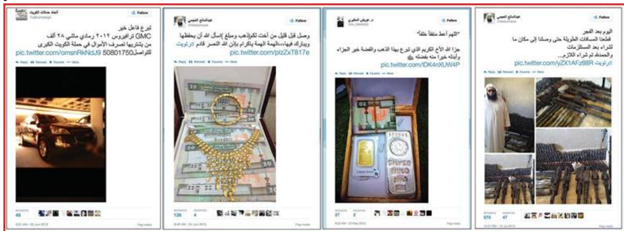
Donations to ISIS Publicized on Twitter

57. In its other Twitter fundraising campaigns, ISIS has posted photographs of cash, gold bars and luxury cars that it received from donors, as well as weapons purchased with the proceeds.