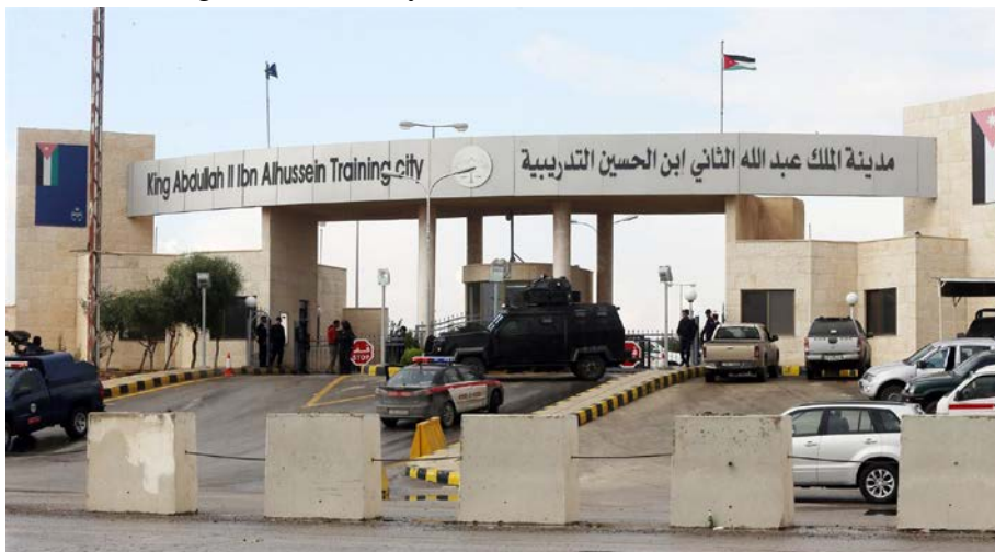
10 11 Entrance to the International Police Training Center in Amman, Jordan

1 Virginia Beach Policy Academy, a former police officer in the Virginia Police Department and had 2 trained police officers in Afghanistan, Kenya and other locations.