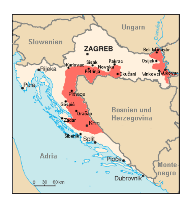
Prosecutor v. Ante Gotovina, et al., Case No. IT-06-90-T, Judgement (April 15, 2011)