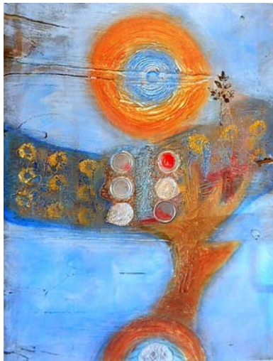
Figure 5. The Seeing Cure . In honor of Jo Spence. 48”h x 36”w. Stained wall compound over plywood, embedded natural objects and food packaging.

landscape implied is ethereal. The blue of the sky over the rough wood creates a cognitive dissonance. Sapphire blue for Hildegard represents compassion, so I adopt that meaning as well. My printed image of the leafy branch represents the biosphere and the gold printed circles are spiritual beings. The flame-like hand is healing power. I have placed the lid of another product at the bottom of this piece. It reads, “National Breast Cancer Foundation.” Although it may appear generous and compassionate for companies to market their products using breast cancer awareness and other women’s health issue promotions, I feel it is sinister and exploitive. While I was working on this piece, my elder sister was undergoing daily radiation treatments following the surgical removal of a breast tumor. She said that seeing all of the pink ribbon messages on products was overwhelming and did not feel like messages of concern or compassion for her. They were relentless reminders of her problem and created anxiety and fear. In honor of Jo Spence, the title of this work is “The Seeing Cure.”