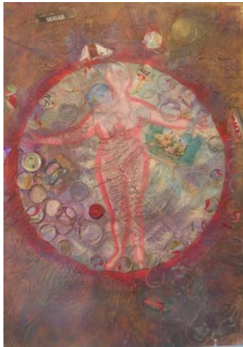
Figure 2. There is Die in Diet and Di in Digestion . In honor of Carolee Schneeman. 48”h x 34”w. Stained wall compound over plywood, embedded natural objects and food packaging.

There is a label from “Diced Mustard Greens,” using “Di” in a way other than Diet, and repeats the excerpt from Carolee Schneeman’s Internal Scroll . In addition, the flat and vibrant mass-produced vegetable imagery on the label is juxtaposed with the real, natural vegetation imprints. Which is “real?” Finally, a philosophical message from a yogurt lid offers wisdom. “Little acts of kindness add up to a lifetime of happiness.” With product messages like this, who needs the Dalai Lama? Is this message meant to nurture my soul or to keep me, as a woman, obsessing over food and my duty to nurture others?