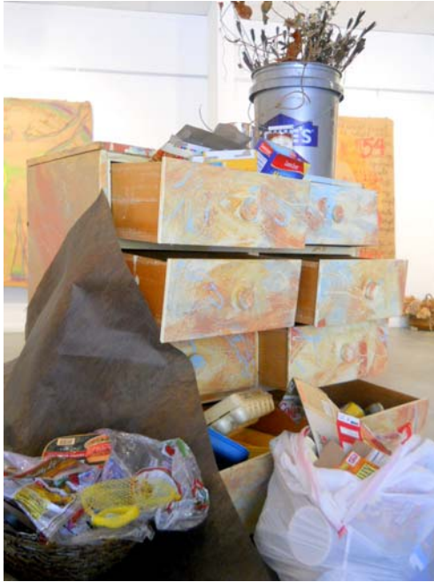
Figure 1. Recycling Center . Installation of painted desk with sorted personal trash.

The main rule, in brief: No buying, use what I have. Insights: the organizing is part of the art-making process. Seeing my trash makes me confront and start to come to terms with my eating and food buying habits.