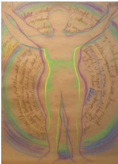
Figure 7. I Am NOT A Muse: Sense. 74”h x 52”w. Pastel on brown butcher paper.

with whom I feel secure and loved, to trace my actual body outline to coincide with my perceived outline. “As soon as the tracing is completed, the client is asked to step away from the paper and view the drawings. It is important for the client to express first impressions by either journaling directly on the paper or verbalizing with the therapist” (89). I step back and look. I see that the blue outline tracing my body is smaller than the purple outline I had drawn from my mind’s eye. Yet, it is with disbelief that I react. I saw my husband using the blue pastel at ninety degrees to the paper and I know he moved it accurately along my periphery. But, I cannot at first believe that I am significantly smaller, thinner than I thought. I retrace the blue outlines of my actual self where I am smaller than my perceived self with a neon yellow pastel to reflect the illumination and energy it releases. I write in rapid script, journaling my thoughts and feelings about the experience in concentric circles around my body outline.