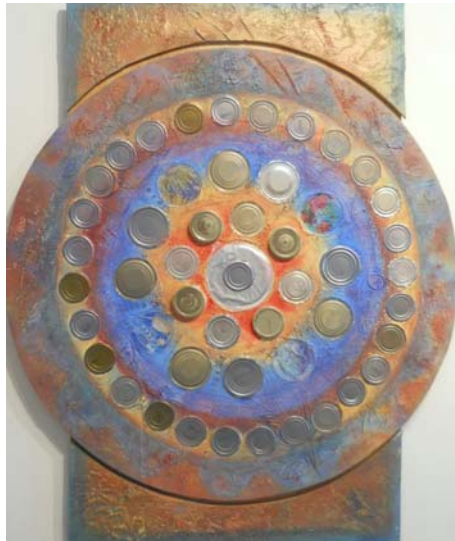
Figure 4. I Hope the End is Joyful, and I Hope Never to Return . In honor of Frida Kahlo. 49.5”h x 40”w. Stained wall compound over plywood, embedded natural objects and food packaging.

beings. Are you human or angelic? Again these circles make reference to the halos of Byzantine icons. In addition to imprinting images from natural plants, I use twine to create a textured line. I have placed the messages from sour cream and yogurt packaging equidistant in the third circle from center. These messages read, “Greek yogurt—more protein, better, healthier option.” “Jumping for joy is good exercise.” “The most precious thing one can make is a friend.” “A smile can start a conversation without saying a word.” The last three messages are brought to you by “Fresh thinking from Daisy,” a part-skim, low fat sour cream. I glazed the background with gold to harken back to Medieval Christian imagery. In honor of Frida Kahlo, I call this work “I Hope the End is Joyful, and I Hope Never to Return,” her last journal entry before dying ( http://www.fridakahlo.com/ ).