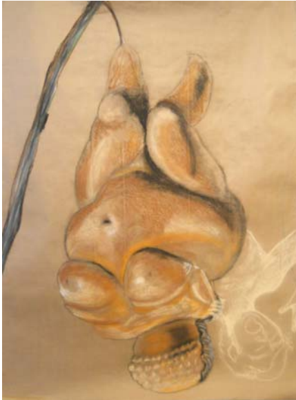
Figure 9. I Am NOT A Muse: Séance . 74”h x 52”w. Pastel on brown butcher paper.

self-loathing and it also helps me to let go of the unrealistic Barbie body image expectation. I am fecund awesome . This series is called “Science, Séance, and Sense: I Am NOT A Muse.”