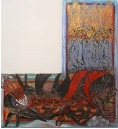
Figure 6. “The L-Word” or Licentious Appetite . Dedicated to Geneen Roth. 38.5”h x 35”w. Stained wall compound over plywood, embedded natural objects and food packaging.