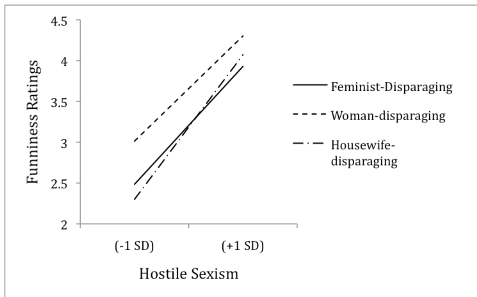
Figure 1. Predicted means for funniness ratings as a function of joke type at one SD above and below mean hostile sexism score.

Offensiveness Ratings. Jokes were first averaged by joke type to form a mean offensiveness score of sexist jokes and a mean funniness score for neutral jokes. Using the General Linear Model in SPSS, I conducted a regression analysis on the offensiveness ratings of neutral jokes with joke type and hostile sexism serving as predictor variables. As expected, there was no significant interaction, F(2, 75) = 1.0, ns , and no main effects of hostile sexism or condition, F(1, 75) = .22, ns and F(2, 75) = .80, ns .