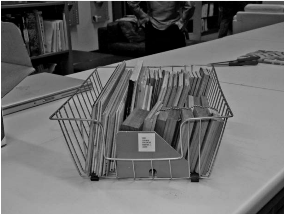
FIGURE 5 Wood Furniture Samples Cataloged for IARC.

In the spring of 2009, permanent staff kept up with the IARC's new monographs and serials while the intern worked on sample books and theses. At the same time, Conger was developing procedures for cataloging samples (Figures 5 and 6 show a sample with its corresponding record.) and undergraduate theses, as well as cataloging the more challenging monographs. Two LIS practicum students joined the project in summer 2009. One concentrated on cataloging the undergraduate theses, the other on the samples, and both worked on writing a manual covering the new procedures. When asked to describe her experience with library staff, Marshall-Baker replies: "They are amazing! Mary Jane and all the various 'helpers' she has enlisted have been enthusiastic and interested in our collection of materials. They've been proactive and inspired us to make our library a more scholarly and studious environment." 16