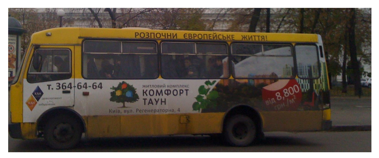
(IMG. 5, ad of a new building complex posted on the bus. The slogan above says, "Start a European life! ")