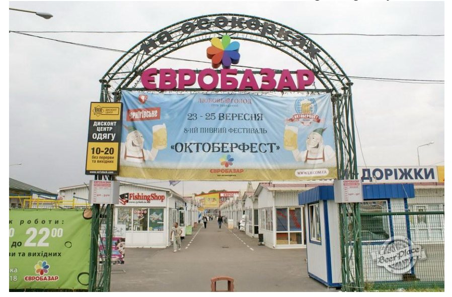
(IMG. 3, entrance into the 'Euro-market' in Osokorky residential area, Kyiv.)