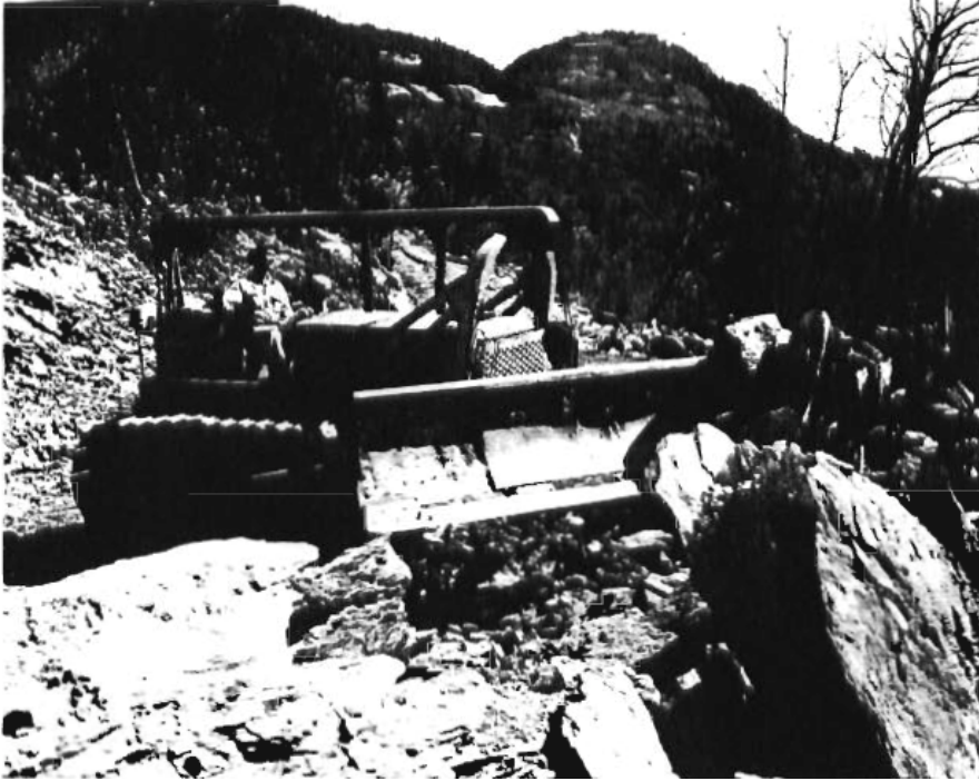
Figure 2: Constructing the Summit Road at Grandfather. Hugh Morton, “Capsule of Facts.”

Morton listed the impact of the proposed routing change on the economy of the area as a concern, illustrating his example with a photo of Grandfather Mountain’s full parking lot on a summer day. Drawing from the constant mentions of the economics involved, both Browning and Whisnant argue Morton’s real concerns with the Parkway’s change of routing were the possible impacts on his tourist attraction. 36 Morton never shied away from the fact that Grandfather Mountain was a for-profit business enterprise, yet imbedded in his language were simultaneous references to the mountain as a masterpiece and natural wonderland.