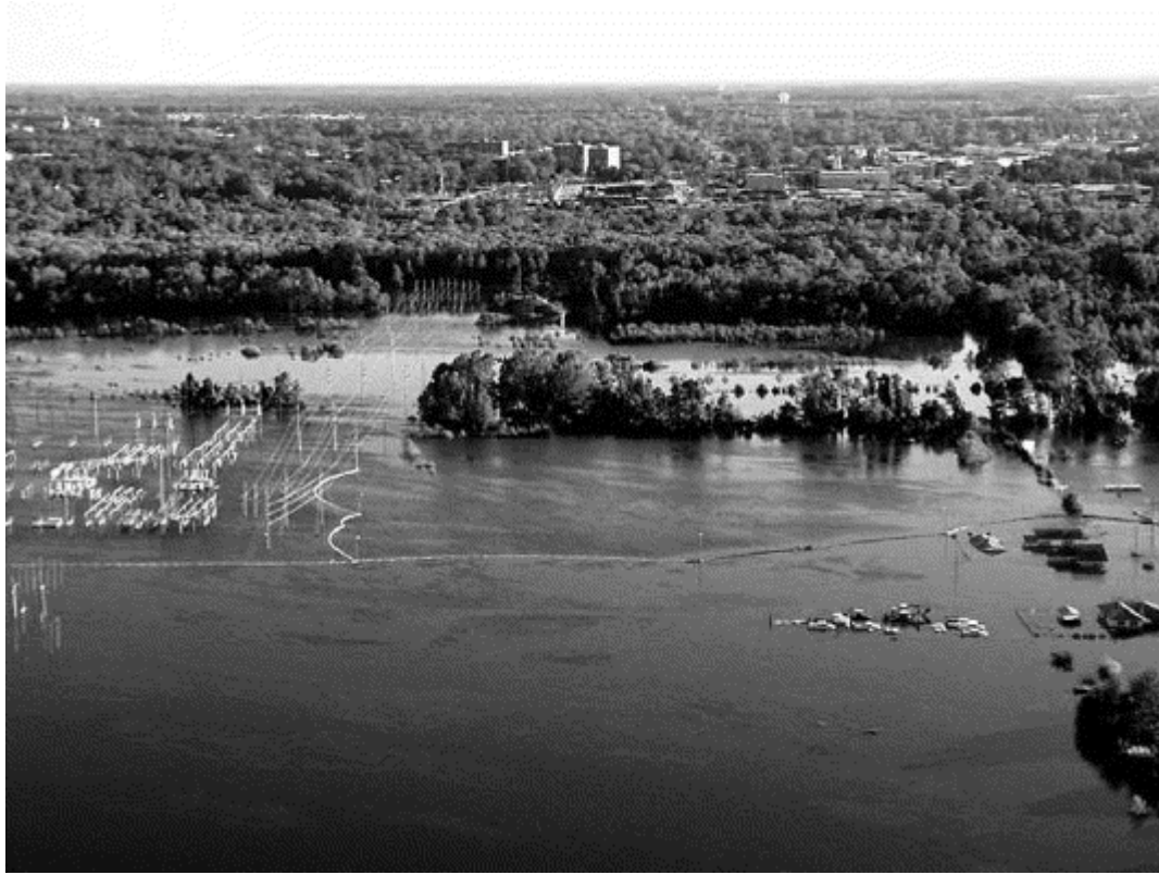
Fig. 1. Flooding along the Tar River in Greenville. View is towards the south with the power substation seen here on the left surrounded by booms. The Tar River channel is hidden beyond the trees but downtown Greenville and the East Carolina University Campus dormitories can be seen on the far side of the river. (Source: Pitt County Management Information Systems).

The area chosen for this study included a section of the Tar River that passed through the City of Greenville in Pitt County, North Carolina (Fig. 2). This area was selected for evaluating the methods for modeling flood extent due to its proximity to Greenville, and because a digital aerial photograph documenting the flooding was available from the North Carolina Department of Emergency Management (NCDEM). The extent of flooding that occurred in this area was indicated on the composite photograph, which was taken two days after peak flood stage had been reached on 23 September 1999.