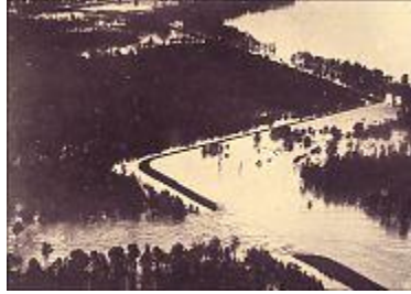
Crevasse in levee on Mississippi River.

results in new river courses and changes in direction. As the river changes course, waterside property can suddenly become landlocked hundreds of yards or even miles inland. Property that once was some distance from the river can just as quickly become waterfront acreage. The river's unpredictable behavior has played havoc with property values and the ability of landowners to manage their farms and plantations.