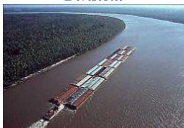
Barge moving goods on the Mississippi River.