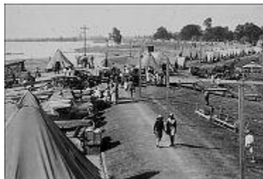
A tent city set up on levee after the 1927 flood.

Because of the various potential river hazards, the economic benefit of a controlled Mississippi River seems obvious. But there have always been the issues of who is responsible for paying for such river alterations and who is capable of managing such a monumental task. Politics, in other words, has shaped the direction of river control as much as any other factor.