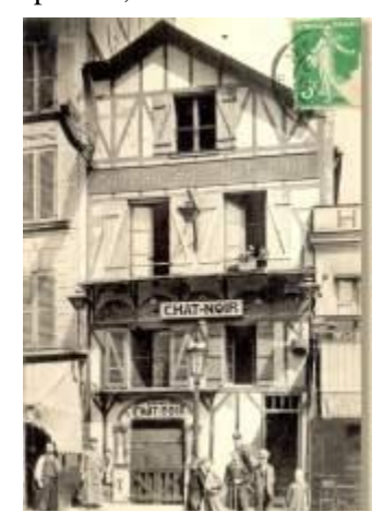
Figure 1: Le Chat Noir, 1906

All music historians agree on the location of the first acknowledged cabaret establishment. Le Chat Noir (The Black Cat), founded by Rodolphe Salis, opened as the first cabaret on November 18, 1881 in the bohemian Montmartre district of Paris.<sup>6</sup> Salis, a struggling painter, found himself fascinated with Montmartre and the cheaper rents there. With the financial