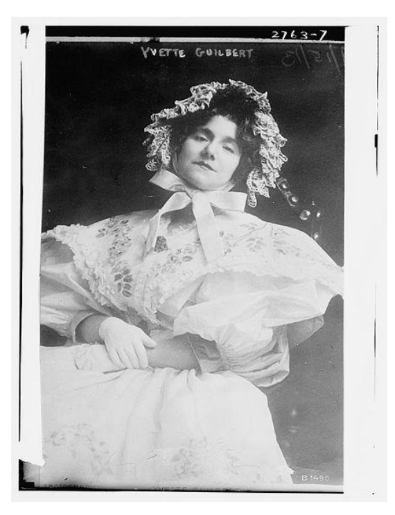
Figure 5: Yvette Guilbert, 1913

economic and social unrest to lead to instability and more political controls. Between 1876 and 1903 alone, Alexander Graham Bell invented the telephone, Thomas Edison invented the incandescent light bulb, Rudolf Diesel patented the diesel engine, Guglielmo Marconi invented the wireless telegraph and the Wright brothers made their first successful airplane flight. In addition to these events, there were significant changes within worldwide politics which propelled unrest and eventually led to World War I (1914-1918). A generation struggled to keep up with the plethora of advancements and although it had an effect on the arts, it had a more significant effect on society.