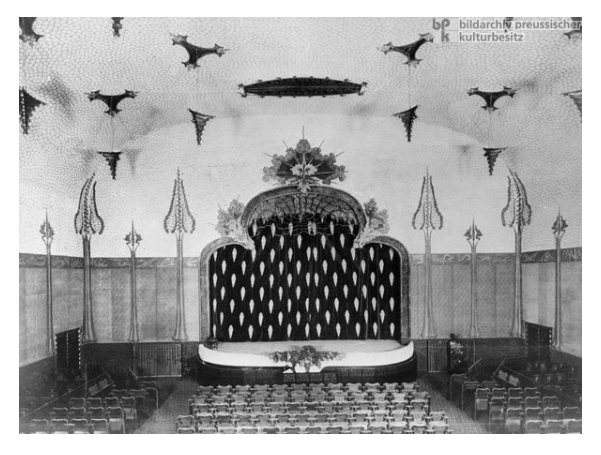
Figure 6: BuntesTheater, Berlin, 1901

In the third verse, the singer, due to the text, should consider a slow accelerando (mm. 49-56). The piano has a ritardando marking in m. 57 which pulls the music back to an a tempo and then the accelerando starts over again, reflective of the text's true meaning; this is sex with the ebb and flow of excitement. Schoenberg cleverly and humorously writes a musical climax indicative of the physical sexual climax and it cannot be ignored. In performance, the singer and accompanist must be completely willing to take full advantage of that moment (mm.65-68) and make use of the ff dynamics and the ritardando . If not performed with a sense of abandonment in the last verse, the song fails in what Schoenberg was seeking. The entire Brettl-Lieder, a combination of eight songs, are intellectually humorous and dramatically suggestive regarding sex. Due to the conservative nature at the end of the century, these songs were antithetical and became popular quickly.