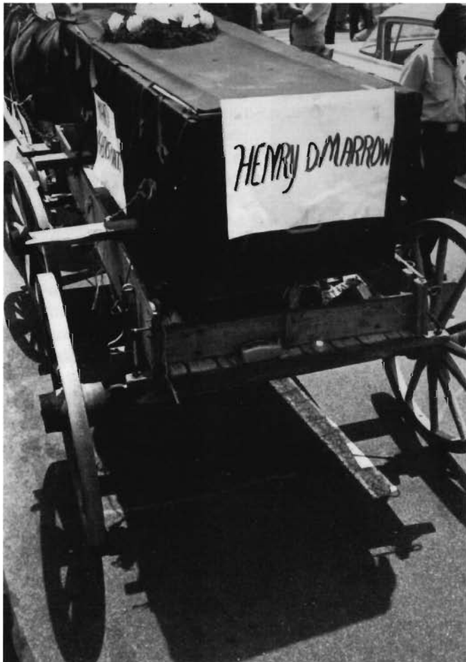
Coffin of Henry Marrow