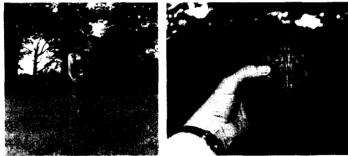
Students weigh, measure, and identify the gender of the turtles.

Initially, we tried to locate turtles by simply walking the school property on favorable weather days, but quickly realized that visual searches for box turtles conducted dur-