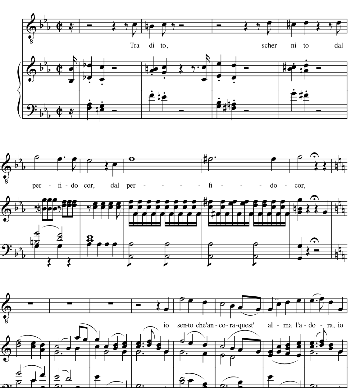
(Example 9: "Tradito, schernito" m. 27-43)