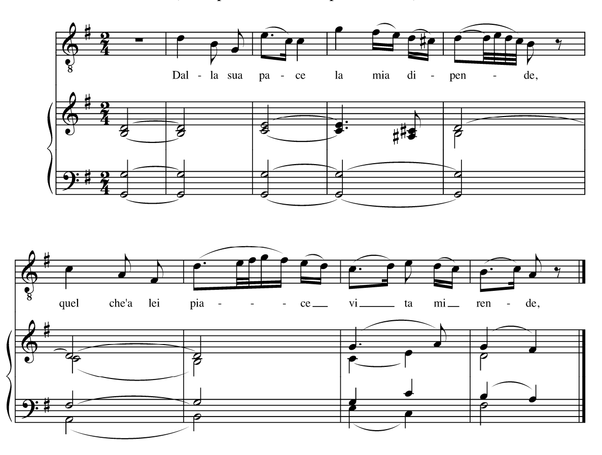
(Example 1: "Dalla sua pace" m. 1-9)

The formal structure of "Dalla sua pace" is an ABA' form plus coda. It is, in essence, a written out version of a da capo aria because the initial 16 bars of the A' section are an exact repeat of the initial A section. The coda that follows the A' mostly reuses old melodic material and is not particularly remarkable. However, the B section makes it clear that we are dealing with "new wine in old bottles." This is to say that while the aria may be seria —like, the B section is strikingly innovative in both its harmonic instability and the fact that it is not tonally closed. By ending the B section on