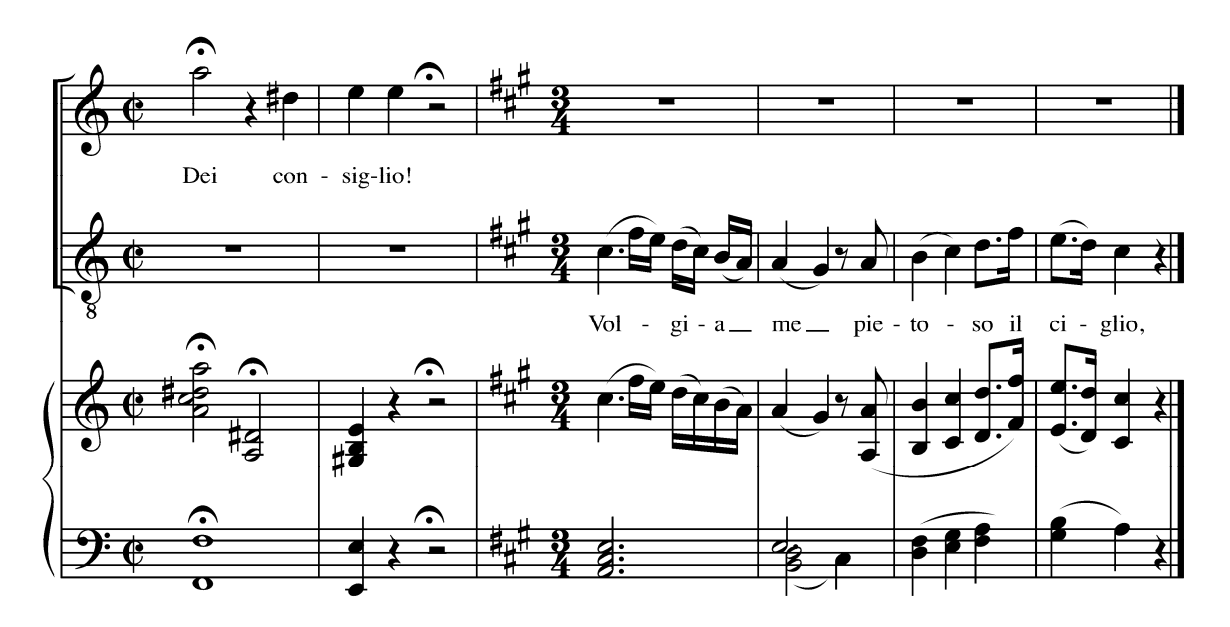
(Example 14 "Fra gli amplessi" m. 76-81)

Upon his entrance, Ferando takes control of the music (m.16), immediately shifting the tonality into e minor and proclaiming he will die if Fiordiligi does not return his love. Fiordiligi tries to resist him by moving the music to C major in the midst of her next vocal line (m. 24), but Ferrando persists, and soon she is echoing his thoughts (m. 47) and the two begin singing in harmony (m.53). After another brief musical struggle, Ferrando reasserts his will, modulating back to A major on his vocal line, "Volgi a me pietoso," (in m. 78) finally completing the seduction. (Example 14)