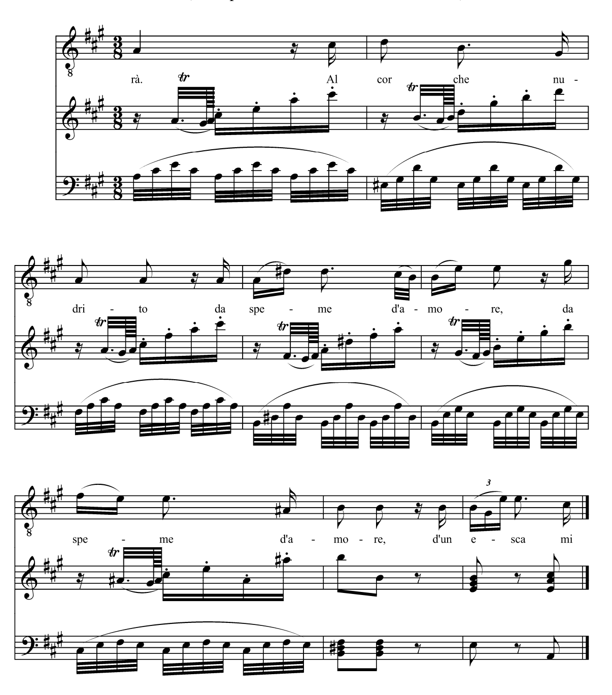
(Example 3: "Un'aura amorosa" m. 23-30)