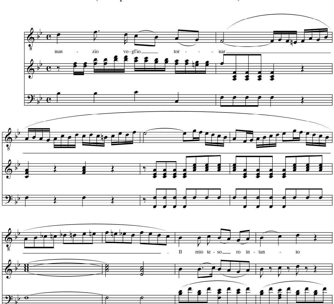
(Example 2: "Il mio tesoro" m. 41-49)

section. The coloratura decelerates in m. 47 and 48 by way of chromatic and later diatonic scales, effectively reinterpreting the recently established tonic F major chord as a dominant seventh chord that leads directly into an almost exactly repeated A section, again in B-flat major, beginning in m. 49. (Example 2)