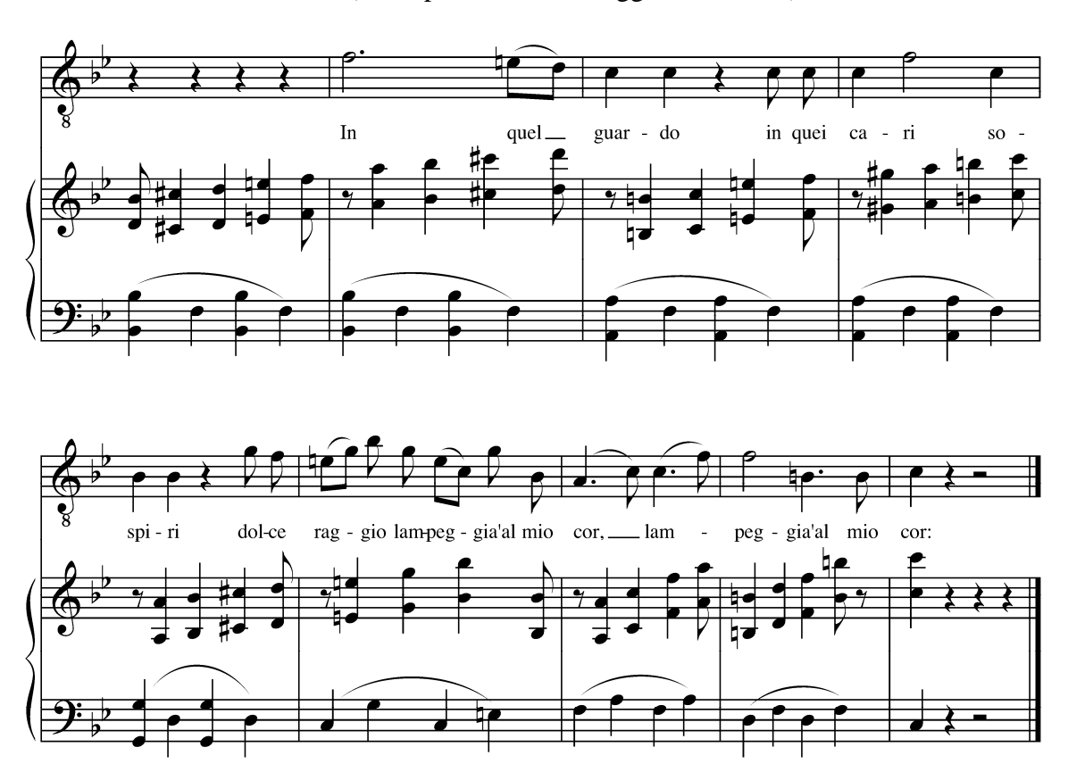
(Example 7: "Ah! lo veggio" m. 14-22)

In the scope of the opera, Ferrando sings "Ah! lo veggio" to Fiordiligi in response to her protestations against his romantic overtures. He has high hopes of winning her heart, and thereby the bet. However, in the third stanza of text, Ferrando realizes that Fiordiligi is rebuffing his overtures yet again. After singing the aria, he promptly leaves the stage in true seria fashion. Surprisingly, the first two lines of this third stanza of text do not correspond to the musical C section and new tempo, but rather to the harmonically unstable interruption/transitional section in m. 93-99. (See Example 6 and figure 4 above) The musical C section actually corresponds to only the final two lines of the text.