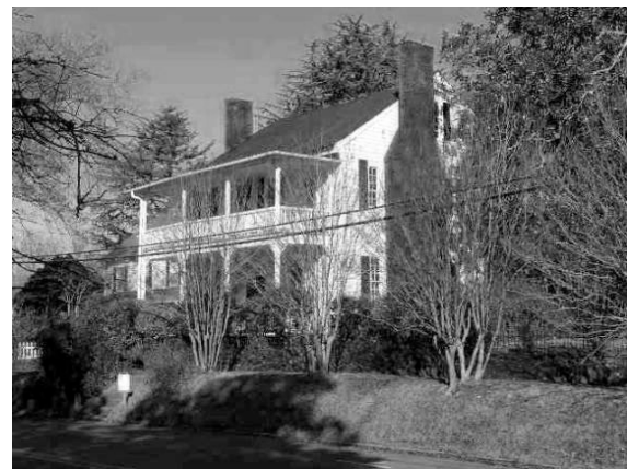
Figure 2. Regulator-era Houses in Hillsborough. From top left: Mason's Ordinary (ca. 1754?); Nash-Hooper House (1772); William Courtney's Yellow House Tavern (ca. 1768 or 1770s); and Twin Chimneys (ca. 1770).