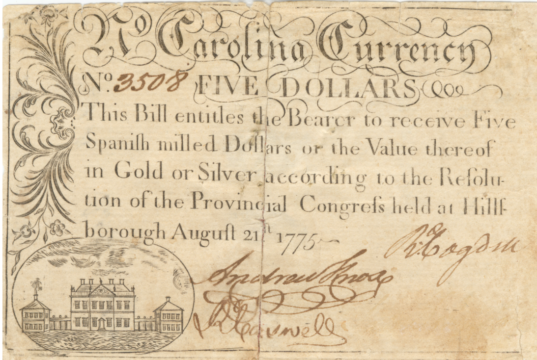
Figure 3. Colonial-era views of Tryon Palace. Top, Palace architect John Hawks' drawing of the north elevation. Bottom, a post-Regulation North Carolina Colonial five dollar bill, showing a line drawing of the Palace; an image of the building was included on currency from just after its completion through the end of the province's colonial period.