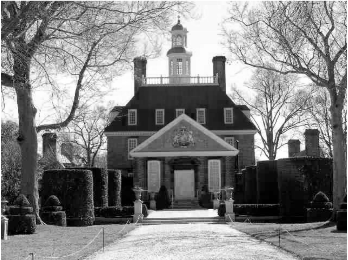
Figure 4. The reconstructed Governor's Palace at Colonial Williamsburg, Virginia. Rear elevation seen here.