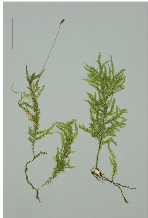
Figure 1. Habit of Porotrichum saotomense (from the holotype). Scale bar = 1 cm.

Dioicous. Perigonia bud-like, on branches and stems; inner perigonial bracts largest, on stems to c. 1.4 mm long, on branches to c. 1.1 mm long, faintly costate, ovate, above midleaf narrowed to a lanceolate-acuminate tip; paraphyses hyaline, uniseriate, filiform. Perichaetia on stems; pre-fertilization perichaetial leaves to 2 mm long, from an ovate, sheathing base narrowed approximately at midleaf to a lanceolate, spreading acumen; costa single, faint, reaching to lower part of acumen at most; margins entire except weakly denticulate near apex; post-fertilization perichaetial leaves to 3 mm long, otherwise as pre-fertilization ones; post-fertilization paraphyses much longer than pre-fertilization ones, hyaline, filiform, mostly uniseriate, few biseriate. Vaginula c. 1.5 mm long, bearing numerous paraphyses and some archegonia. Seta to 2.8 cm long, greenish-yellow, smooth throughout or slightly mammillose below capsule. Capsule erect or inclined, c. 2.0 × 1.0 mm when wet, cylindrical; exothecial cells irregular, mostly penta- to heptagonal, transverse or isodiametric to elongate, c. 15–50 × 15–25 μm; apophysal stomata several, phaneroporous. Peristome