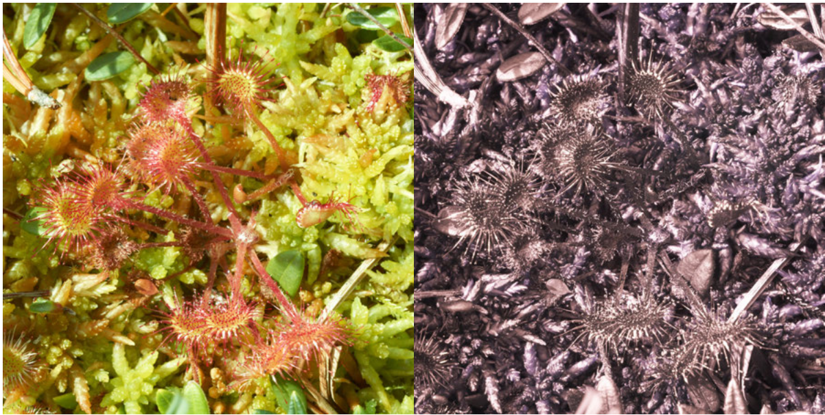
Figure 5.1: Drosera rotundifolia plants in visible light (A) and under UV radiation (B) showing reflectance of tentacles.

shape and colour are often listed as key attractants for insects (Joel et al. 1985), with in some cases flowers emitting different scents as the trapping-structure to avoid potential pollinator-prey conflicts (Ho et al. 2016). Yet, it has also been suggested that UV-radiation plays a role in prey attraction (Joel et al. 1985). In fact, in 2012/2013 several major news outlets reported that “These Carnivorous Plants Glow Under Ultraviolet Light to Attract Prey” (Smithsonian.com, December 11, 2013), “Carnivorous Plants Glow to Attract Prey” (National Geographic, February 25, 2013), and “Carnivorous plant species glow blue to lure prey” (BBC Nature, February 19, 2013). These stories referred to strong UV-induced fluorescence, which was reputed to attract prey, and an example of which is shown in figure 2. Here, I will explore the evidence for a role of UV-radiation in attracting prey, and identify some of the gaps in our understanding of this putative role of UV-radiation.