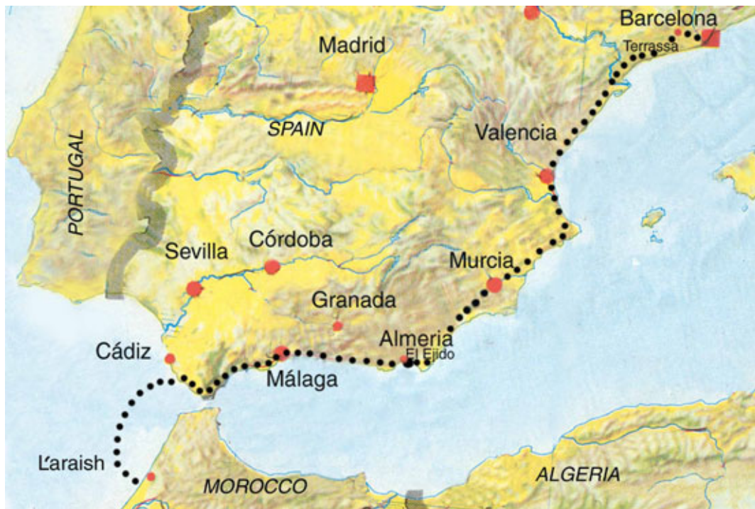
From L'araish to Terrassa: the route of the ḥarrāga.