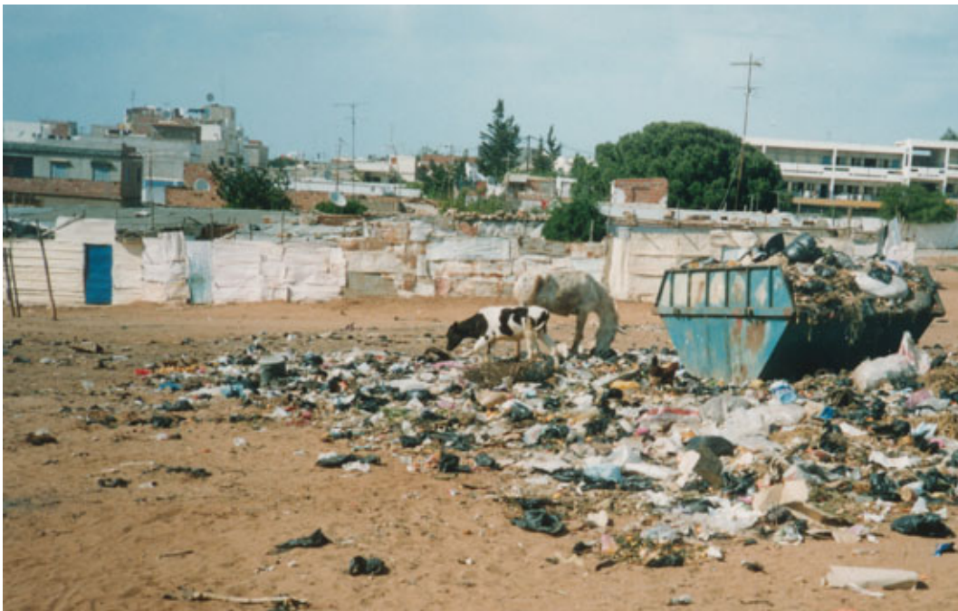
The quarter of Klito.

The housing conditions further deteriorated in many areas towards the beginning of the 1990s. Besides the local migrations from the rural areas of Khemis Sahel, Ar Rasana, Bani 'Arus and 'Awamira a new wave of migration from the more distant regions started in the early 1980s. The majority of these migrants came from the Northern provinces of Tangiers and Tetuán but considerable numbers of migrants also arrived from the vicinity of Casablanca, Settat in North-Central Morocco, the Rif on the Northern Mediterranean coast and the Errachidia region in Central Morocco (PAIDAR Med 1996, 143; Al Harraq and Al 'Ali 1996, 42).