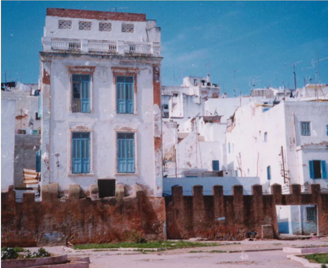
The historic centre of L'araish.

Around nine p.m. the flow of people takes a new turn. Many head up the hill to reach the more remote corners of the whitewashed section, built by the Spanish, yet the majority seem to go even further. They walk another two to four kilometres to the dozens of quarters, the oldest of which were set up by thousands of hunger-stricken rural migrants from regions on Morocco's Mediterranean coast who arrived after continuous droughts had hit the areas in the late 1930s and 1940s (Seddon 1981, 132-134).