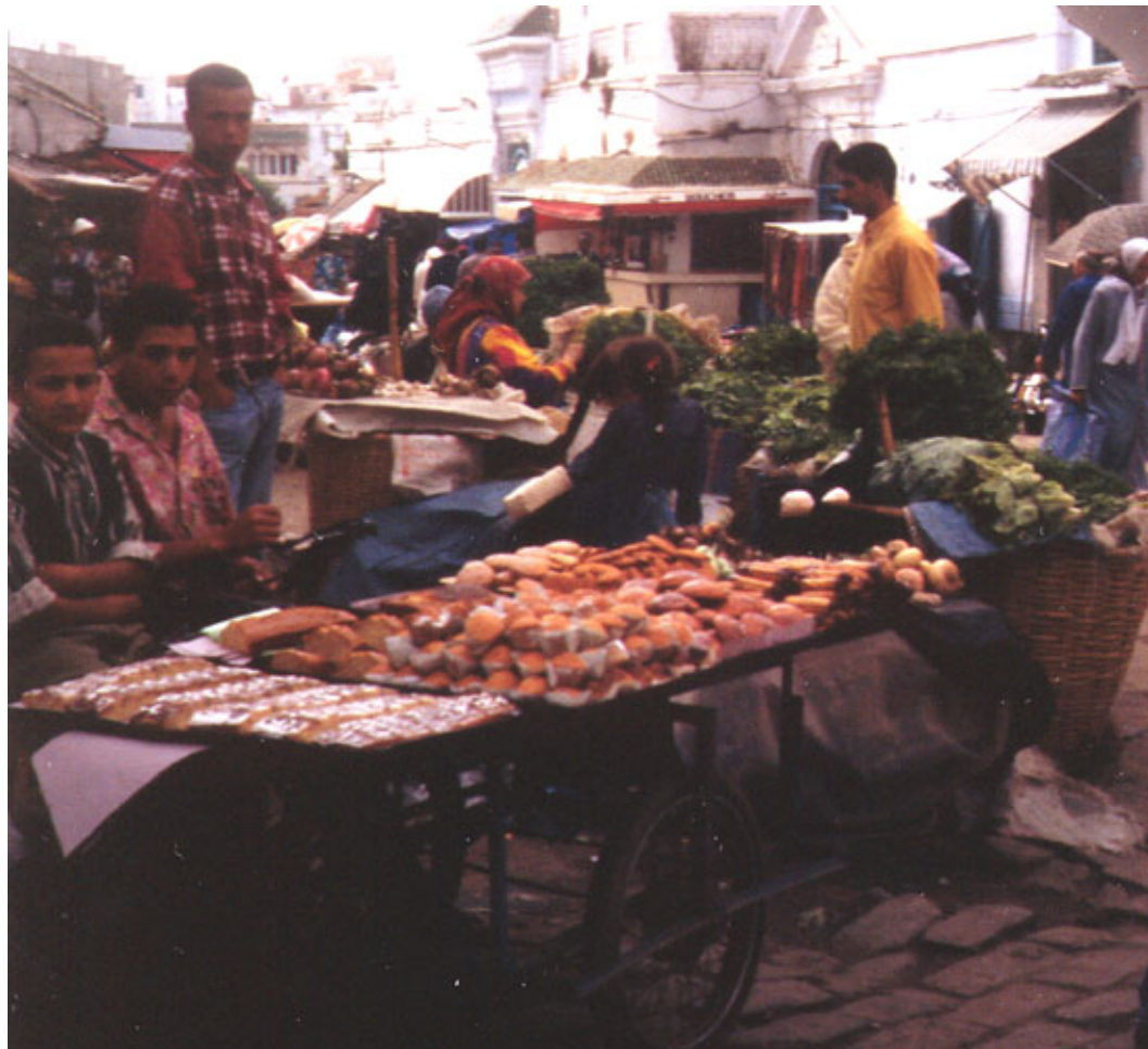
Street vendors in the historic centre.

they ever befriended a gauri 59 before. They said that I was the first one they had talked to for any long period of time. Of course, they said, they had guided the occasional tourist or two who visited L'araish towards the Pension Málaga or Hotel España. I certainly must have aroused their suspicion by speaking Moroccan Arabic and indicating that I was interested in talking about migrant smuggling.