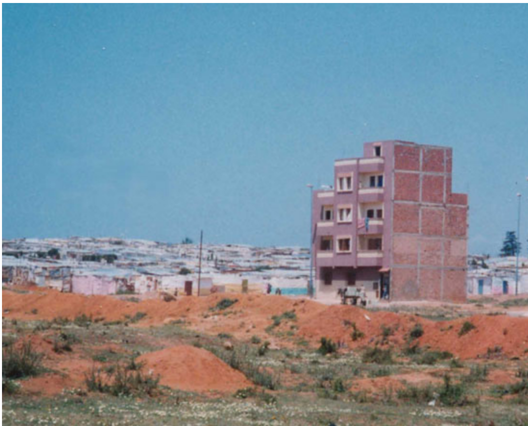
A view from the quarter of Sha'ban towards the shanty-town of Guadaloupe.

Though Sha'ban is where L'araish ends, it marks a boundary line for the community only in a geographical sense. The absence of house owners suggests that L'araish as a social community does not end here.