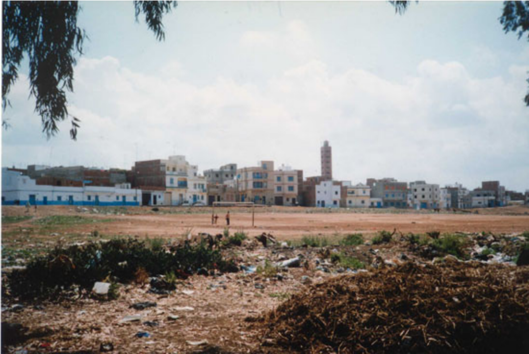
Western side of the al Hayy al Jadid quarter.

Following Morocco's independence in 1956 the population had dropped considerably, from 42,000 to 31,000 as a result of the departure of a proportion of L'araish's Spanish residents (Abu Lughod L. 1980, 248). Both urban and demographic development remained very slow during the subsequent two decades until the massive expansion during the 1980s. The population exceeded 90,000 individuals in the first half of the 1990s (ibid., 43).