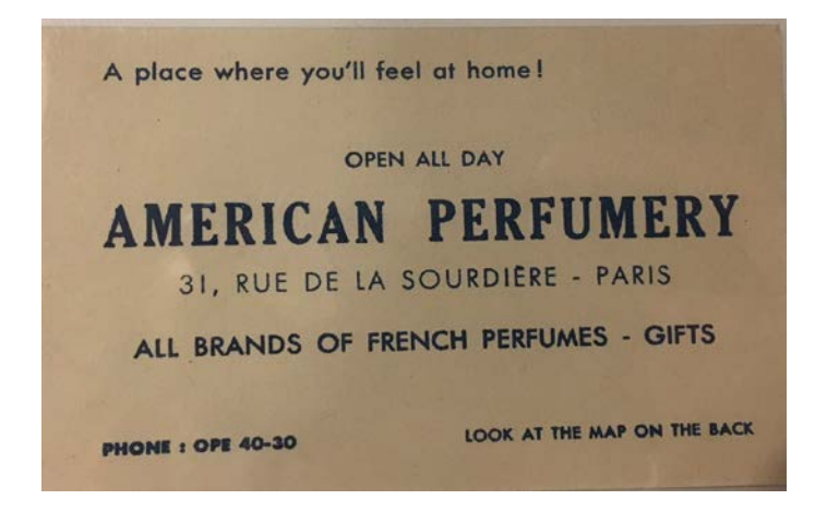
Figure 2 - Business Card of American Perfume Shop 49

Meanwhile, French businessmen and women who had been struggling for months because of cutbacks on electricity and resources, along with interruptions from bombings, jumped at the chance for business from American GIs craving any sort of "American" experience. As they converted to these American-isms, Parisians embraced American culture. Hamburger shops opened across the boulevards of Paris, while businesses supplied American bourbon that was slowly shipped over. Even parfumeries , a Parisian staple in the global market of perfumes, converted to the American way so as to gain business.