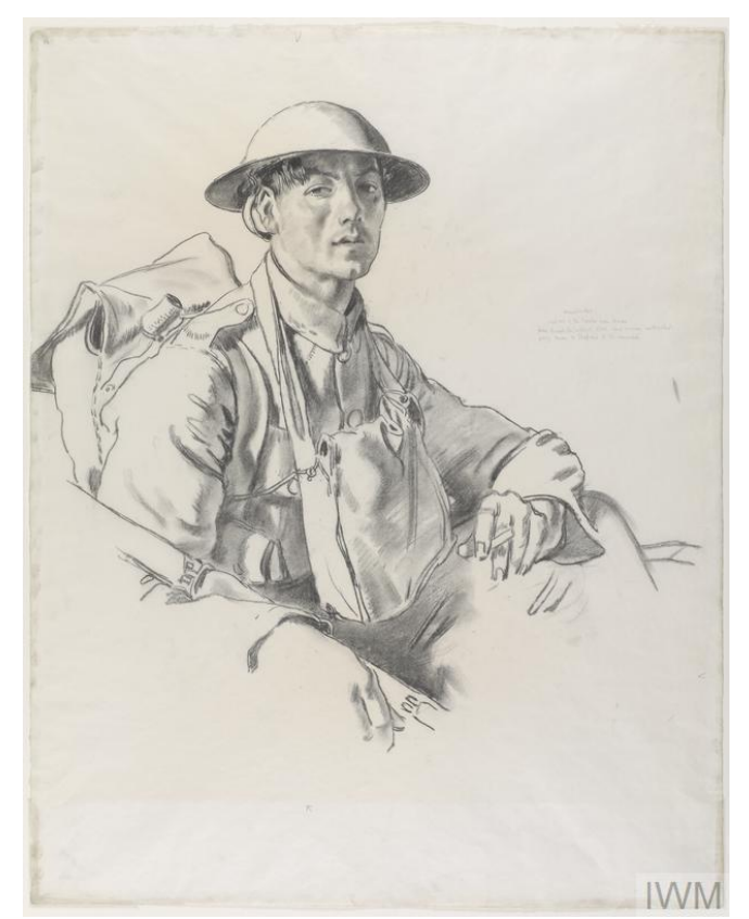
Figure 1: William Orpen, The Manchesters, Arras. Just out of the trenches near Arras. Been through the battles of Ypres and Somme untouched. Going home to Sheffield to be married. Charcoal on paper, 508 x 444 mm. 1917. Collection of Imperial War Museum.

His sketches of ordinary infantrymen are especially poignant in his dedication to achieving this goal. Of one subject, whom Orpen drew in 1917, he recalls he "was quite happy. He had ten days' leave and was going back to some village near Manchester to be married. He showed me her photograph, a pretty girl. Perhaps he was killed afterwards."<sup>23</sup> That sketch, now the property of the Imperial War Museum, is captioned in Orpen's writing with a list of this nameless "Tommie's"[sic] soldierly achievements, having come "just out of the trenches near Arras", he had "been through the battle of Ypres and Somme untouched."(Fig. 1)<sup>24</sup> By affording