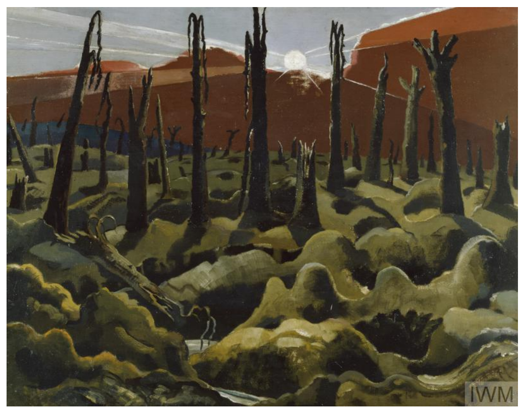
Figure 3: Paul Nash, We Are Making a New World. Oil on canvas, 711 x 914 mm. 1918. Collection of Imperial War Museum.

Much can be said of We Are Making a New World , but it can hardly be called feeble. The acrid sky and the cratered ground, stabbed by the husks of trees, is aggressive and accusatory. Nash's work presents a (sur)reality; his title presents its creators. During his war, he saw fields deflowered by entrenchment, woods disemboweled by explosives. The same periodical which reviewed Orpen's 1918 show also reviewed "Pictures by Lieut. Paul Nash, an official artist on the Western Front" on the very same page, saying that Nash insisted on portraying "devastated nature and tortured earth" in order to "convey his feeling" on the war.<sup>49</sup> The world as he knew and loved it was becoming alien and grotesque, deformed by the actions of insignificant men and