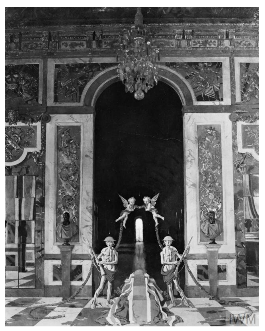
Figure 2: William Orpen, To the Unknown British Soldier in France . Photo reproduction, oil on canvas, 1542 x 1289 mm. 1923.

And then, you know, I couldn't go on. It all seemed so unimportant somehow. In spite of all those eminent men, I kept thinking of the soldiers who remain in France forever ... So I rubbed out all the statesmen and commanders, and painted the picture as you see it – the unknown soldier guarded by his comrades.<sup>29</sup>