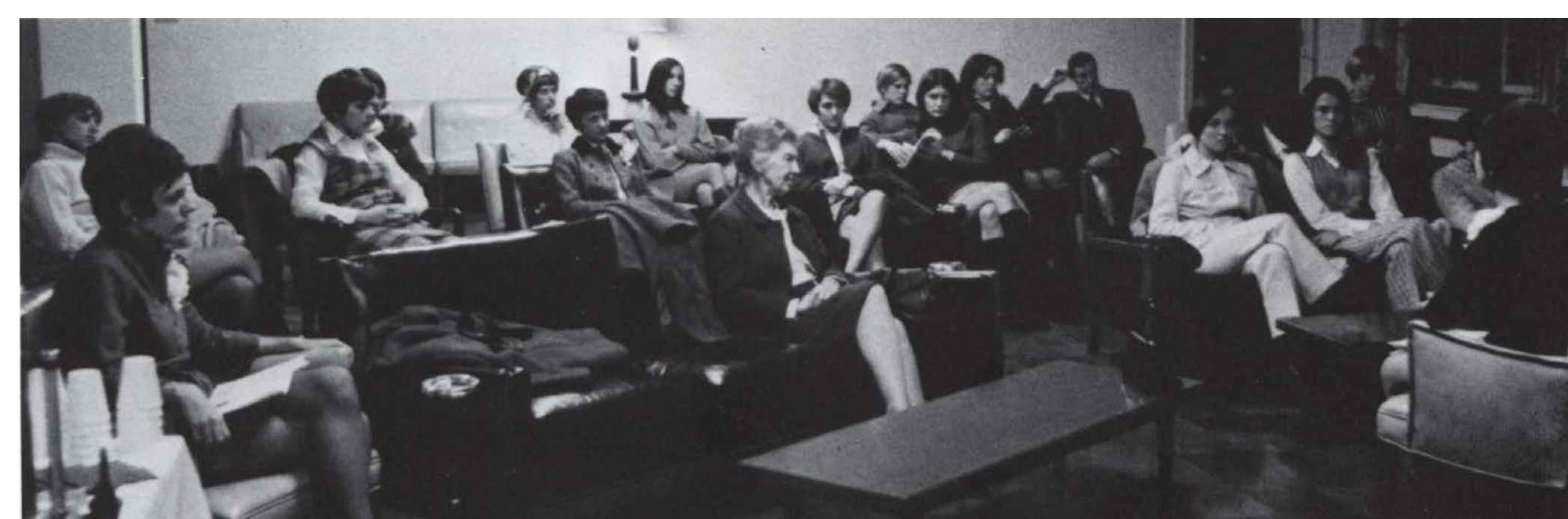
Women's Student Government. 1970 Spectrum, 85. Gettysburg, PA: Gettysburg College, 1970.

"[the rules were] unfair, too strict, singled [women] out from men. I understand the desire to keep women 'safe,' but seriously!! Women were coming from homes with no such regulations. Hours were 'over the top!'"