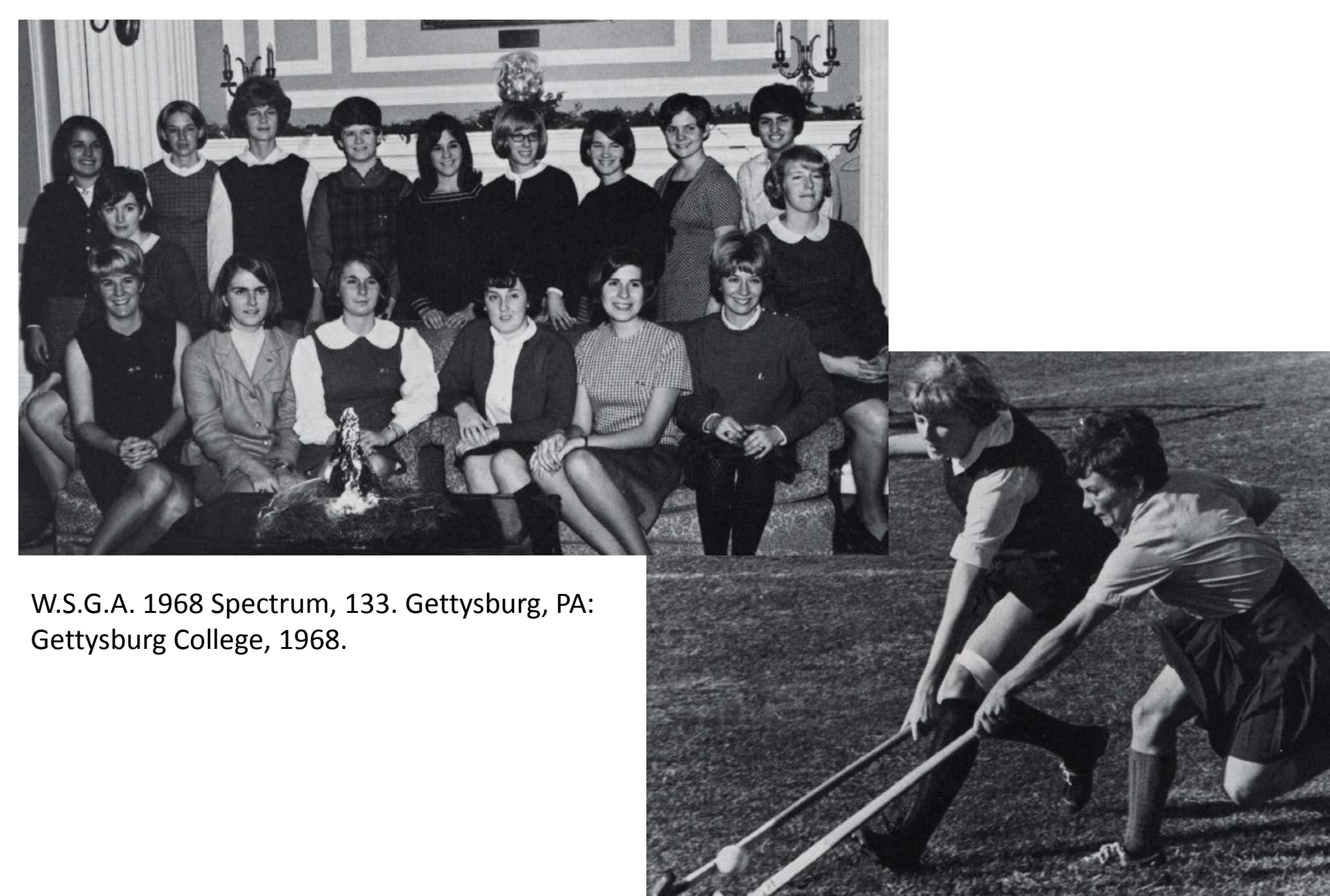
W.S.G.A. 1968 Spectrum, 133. Gettysburg, PA: Gettysburg College, 1968.

The goal of the project was to understand the experiences of Women at Gettysburg College from 1965-1975. All areas of student life were examined: academics, activities, Greek Life, clubs, athletics and residence life.