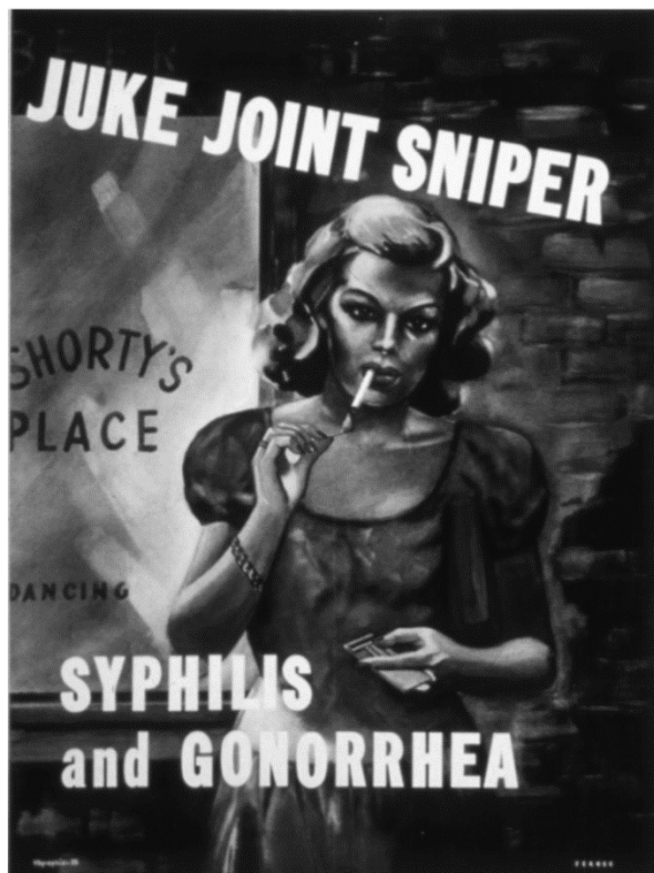
Figure 4: “Joint Juke Sniper” is one example of how posters associated women with venereal disease. In the background is a dance hall, “Shorty’s Place,” which is the kind of establishment where soldiers and women would often meet.

“Venereal Disease Covers the Earth. Learn to protect yourself now” 1940. NIH National Library of Medicine Digital Collections , accessed November 8, 2016, https://collections.nlm.nih.gov/catalog/nlm:nlmuid-101439085-img .