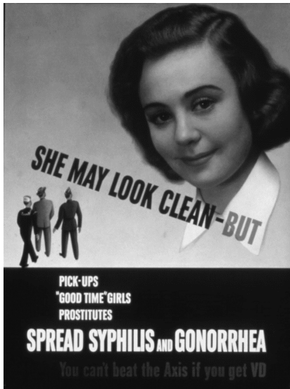
Figure 5: “She May Look Clean - But”, printed in 1940, not only tells the soldier who to be wary of – women – but also tells them why. The text on the bottom reads, “You Can’t Beat the Axis if you get VD.” The poster lists colloquial terms used to describe women who could be infected.

“She may look clean – but” 1940. NIH National Library of Medicine: Profiles in Science: Visual Culture and Health Posters , accessed November 8, 2016, https://profiles.nlm.nih.gov/ps/retrieve/ResourceMetadat a/VCBBCF .