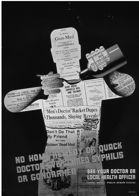
Figure 1: “No home remedy or quack doctor ever cured syphilis or gonorrhea” was a poster made by the Public Health Service to combat the widespread reliance on cures that were ineffective and not medically sound.

“No home remedy or quack doctor ever cured syphilis or gonorrhea” United States Public Health Service, n.d. NIH National Library of Medicine Digital Collections , accessed November 8, 2016, https://collections.nlm.nih.gov/catalog/nlm:nlmuid-101450677-img .