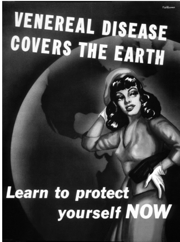
Figure 3: “Venereal Disease Covers the Earth” is a poster printed in 1940. The visual connects women with venereal disease. It also alludes to soldiers’ susceptibility to disease whether they are at home, the European Theater, or Pacific Theater.

“Venereal Disease Covers the Earth. Learn to protect yourself now” 1940. NIH National Library of Medicine Digital Collections , accessed November 8, 2016, https://collections.nlm.nih.gov/catalog/nlm:nlmuid-101439085-img .