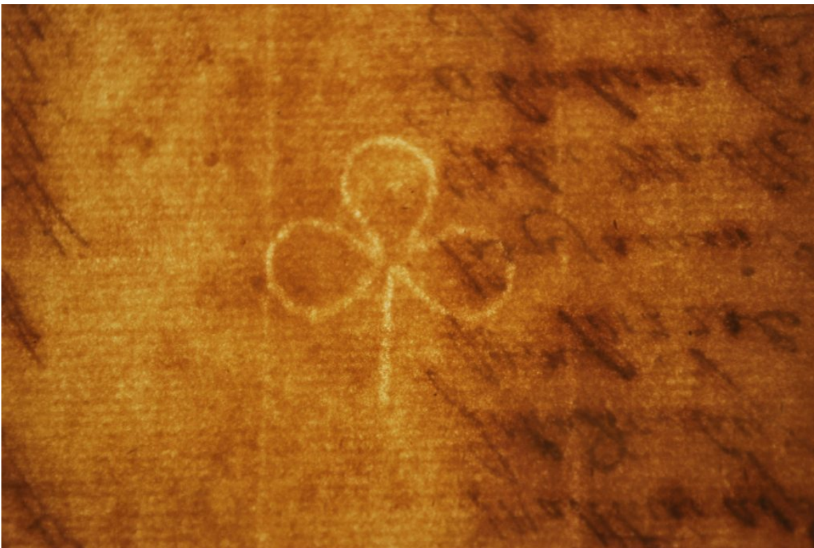
Clover of the Rittenhouse Mill, Early American Document Collection, Special Collections at Gettysburg College

Eventually, I began to find my answers. My first lead came from the Internet (of course), where I discovered that the lions and X patterns were the Coat of Arms of Amsterdam. I researched other leads from there (ensuring that it was not also the New Amsterdam crest, trying to locate domestic papermakers that used the crest, etc.) for a while more, as there were multiple copies of this watermark, but in various forms.