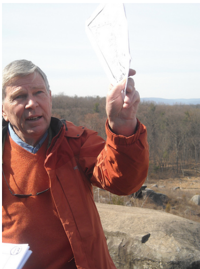
A historian emeritus from Princeton on a battlefield...