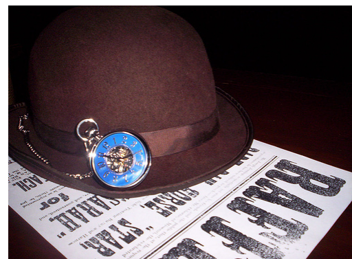
The hat I wore at Harpers Ferry, atop a period advertisement for a slave raffle.

So what's my opinion on Brown? I think he struck the match for a holy war, a war that was guided by a principle that there is law and there is justice, and the two don't