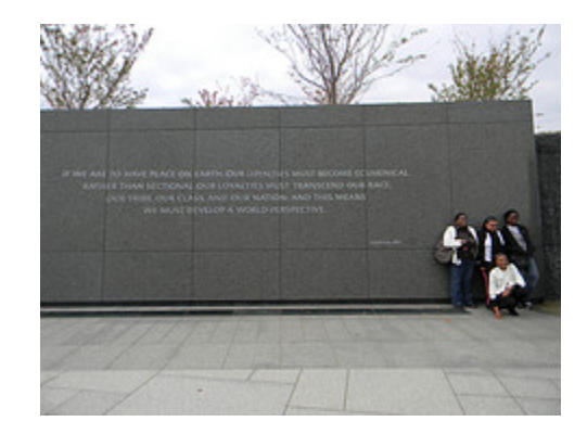
A Family and a King quote

Along the walls behind King, next to quotes about strength and weakness, about war and peace, about violence and justice, families posed to have their photos taken. Others studied the quotes, pondering for long minutes. Along the pathways, lining every inch of curb, groups sat. They were talking.