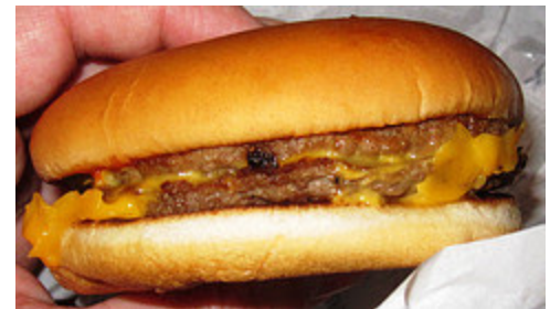
This is what "one" looks like.

I have this philosophical challenge that I call the McDouble Problem. It was born of a conversation between myself and a few of my college friends when I noted to my close, personal economics geek that I can't understand the national debt. "What is 4 trillion dollars?" I asked, "It's an imaginary number. I can't visualize 4 trillion anything."