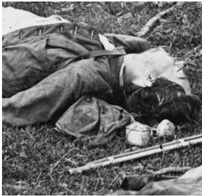
His young face speaks louder than any statistic can.

...Americans are not descendants of a regiment; we are sprung from men and women."