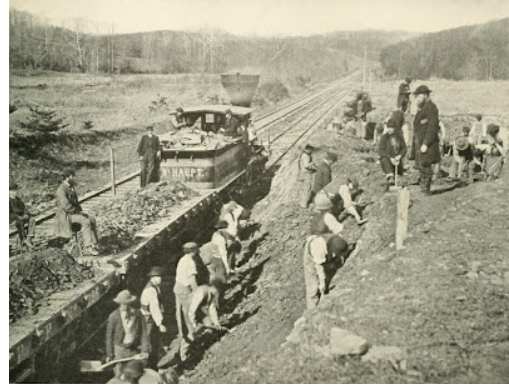
General Herman Haupt, surveying the work of the General Herman Haupt . Yup, Haupt was so cool they named a train after him.

When war erupted, Haupt tendered his services as a railroad engineer, repairing and laying out new lines to support the operations of the armies in the field around Washington, D.C. As cannon roared in the three-day volcano of Gettysburg, Haupt painstakingly organized the repair of Pennsylvania and Maryland's ravaged rail infrastructure. Rail service to Gettysburg was restored by Haupt's careful work within days of the battle, a job Meade expected to take the better part of a month. Rail cars were flowing into Gettysburg in time to give General Daniel Sickles a smooth trip from the field of battle back to the halls of Congress to help crucify his former commanding general in front of the Committee on the Conduct of the War.