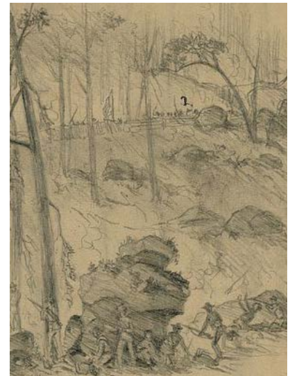
Edwin Forbes' artistic interpretation of the birthpangs of a nation.

But 1863 changed the American nation irrevocably. First, January brought the effective death-knell of slavery, as the war transformed. Every soldier wearing a suit of blue instantly became a freedom fighter, even if his body and soul felt otherwise. Every step of forward progress of the United States armies became a forward step toward fixing the fundamental contradiction of the American founding: in a nation where all men were born with liberty, some men had that freedom cruelly stolen from them in a government supported program of systemic slow-motion murder.